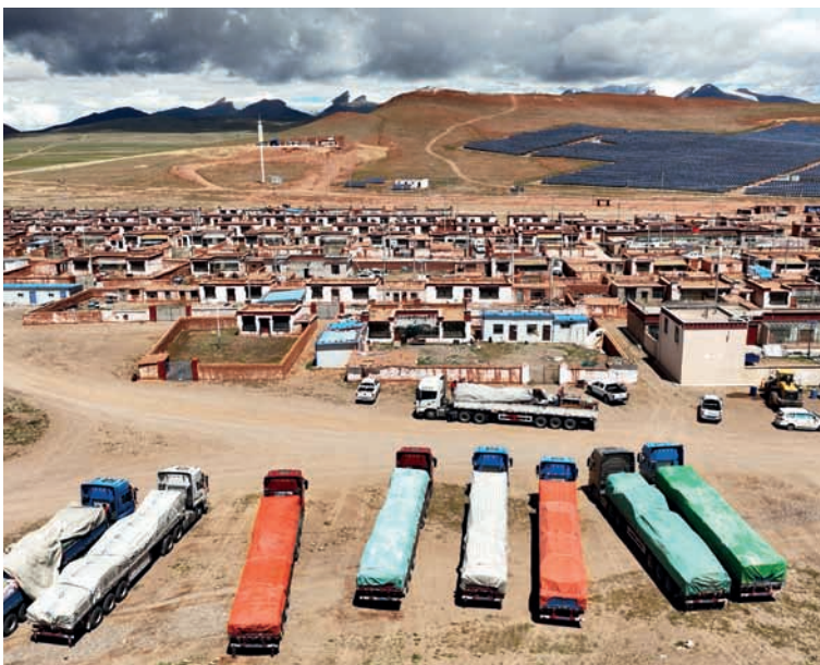
Aerial photo shows trucks carrying furniture departing from Doima township of Tsonyi County in southwest China’s Tibet Autonomous Region on July 13. Jigme Dorje

By late 2021, more than 400 serious diseases could be treated without patients leaving Tibet, and more than 2,400