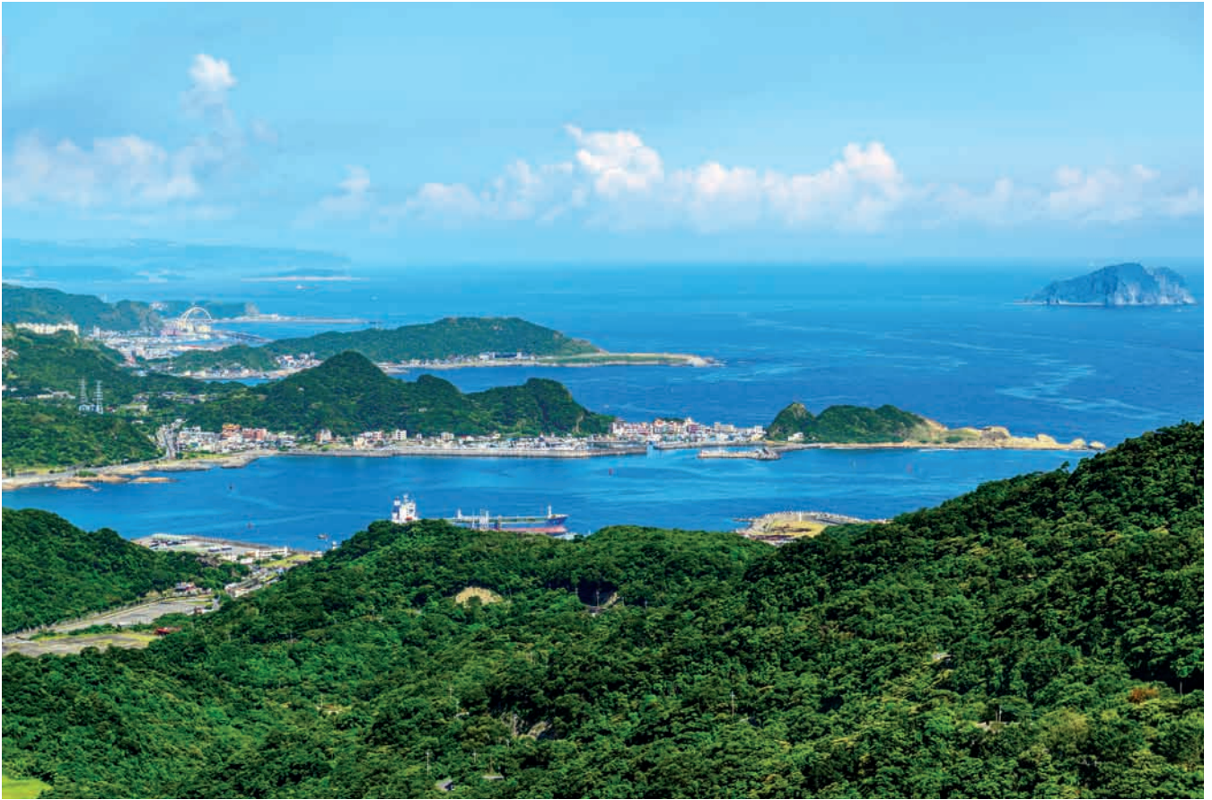
An aerial photo of the city of Keelung, southeast China's Taiwan