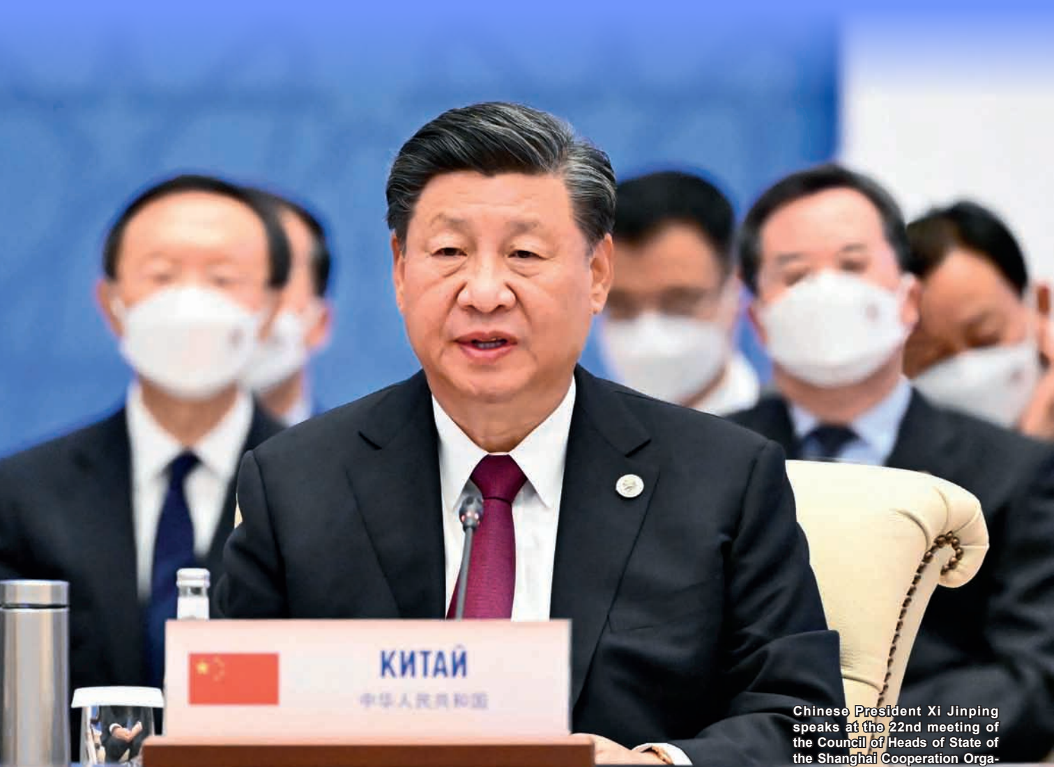
Chinese President Xi Jinping speaks at the 22nd meeting of the Council of Heads of State of the Shanghai Cooperation Organization in Samarkand, Uzbekistan on September 16.