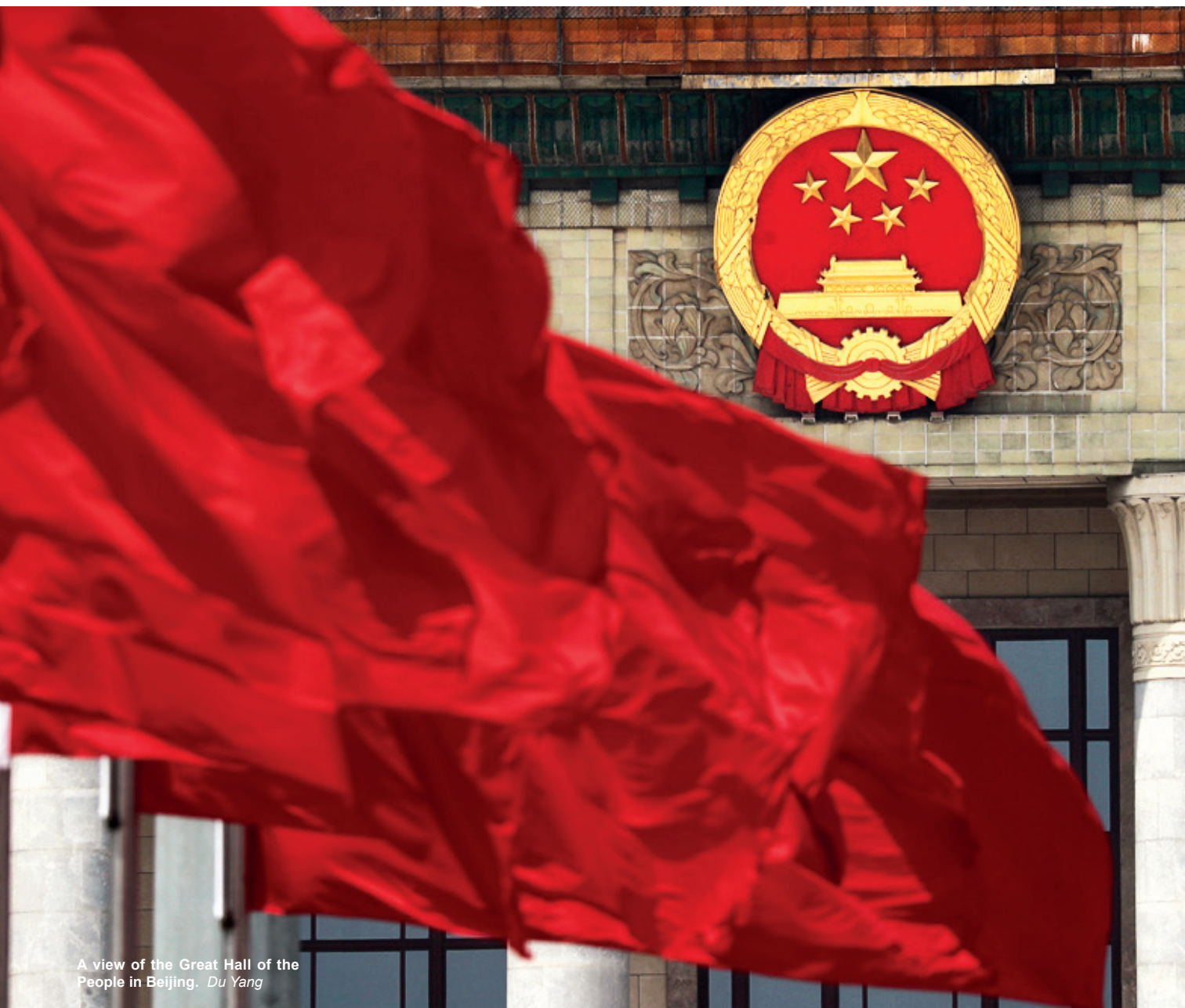
A view of the Great Hall of the People in Beijing. Du Yang