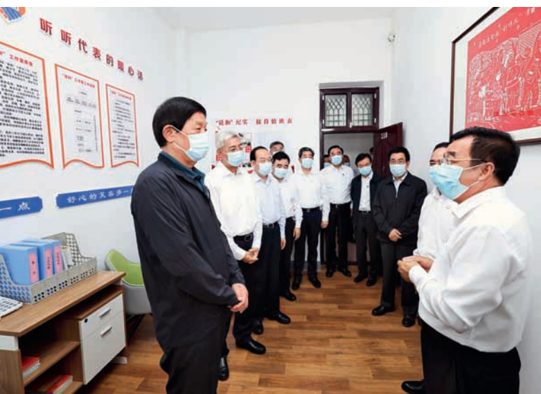
Li Zhanshu, member of the Standing Committee of the Political Bureau of the Communist Party of China Central Committee and chairman of the National People's Congress Standing Committee, visits Houguanzhai Town in Xifeng District of Qingyang during his inspection tour of northwest China's Gansu Province on August 26. Pang Xinglei

L i Zhanshu, chairman of the National People's Congress (NPC) Standing Committee and member of the Standing Committee of the Political Bureau of the Communist Party of China Central Committee, stressed the need to protect the Yellow River in accordance to law and use the river to benefit the people during an inspection tour of northwest China's Gansu Province on August 26-28.