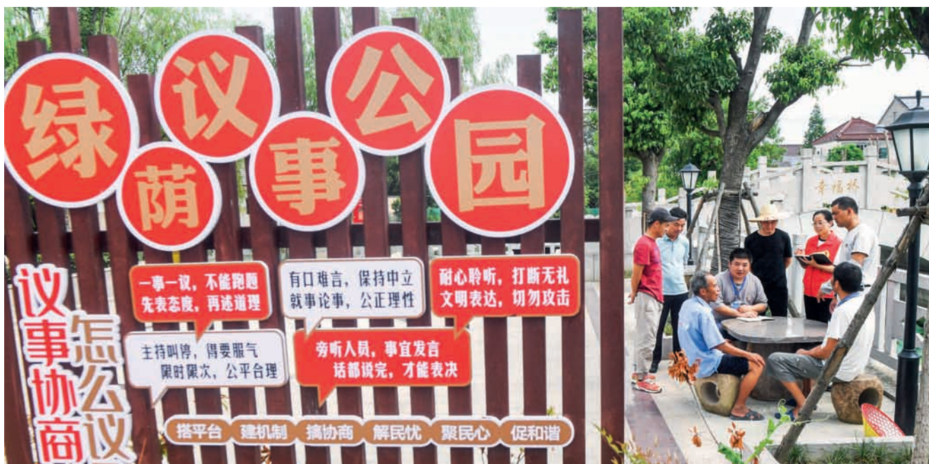
Villagers, Communist Party of China members and cadres discuss village management in Longxi village of Huzhou in east China's Zhejiang Province on July 21. Xu Yu