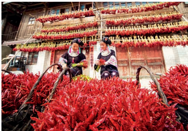
Villagers sort out chili peppers in Donglang Township of Congjiang County, southwest China's Guizhou Province, on September 15. Wu Dejun

During a research tour in Huachuan County, Heilongjiang Province, the local practice of utilizing databases and other hi-technology means to ensure the monitoring of the entire process of agricultural production received recognition. For instance, sensors were installed for real-time monitoring of seedlings, weeding, fertilization, storage, processing and logistics. With mobile apps, people can get synchronous intelligent analysis of soil moisture, crop growth, disease and pest prevention, all ensuring the high quality of products.