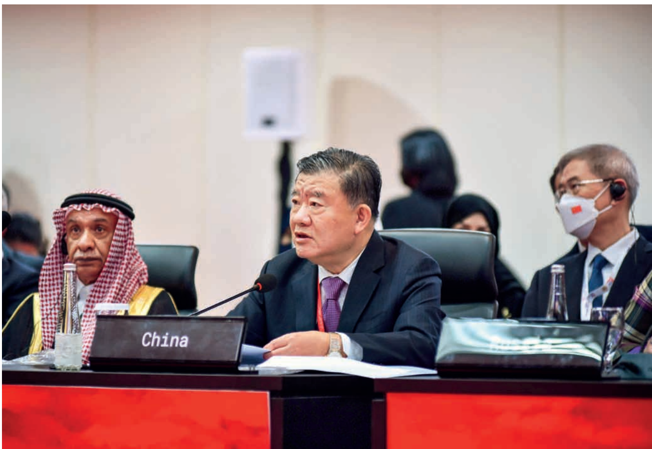
Chen Zhu, vice chairman of National People's Congress Standing Committee, delivers a keynote speech at the 8th G20 Parliamentary Speakers' Summit in Jakarta, Indonesia on October 6.

During the summit, he also met with Indonesia's House of Representatives speaker Puan Maharani, speaker of the Federal National Council of the United Arab Emirates Saqr Ghubash, Suriname's National Assembly chairman Marinus Bee and president of the Inter-Parliamentary Union Duarte Pacheco. (Xinhua) ■