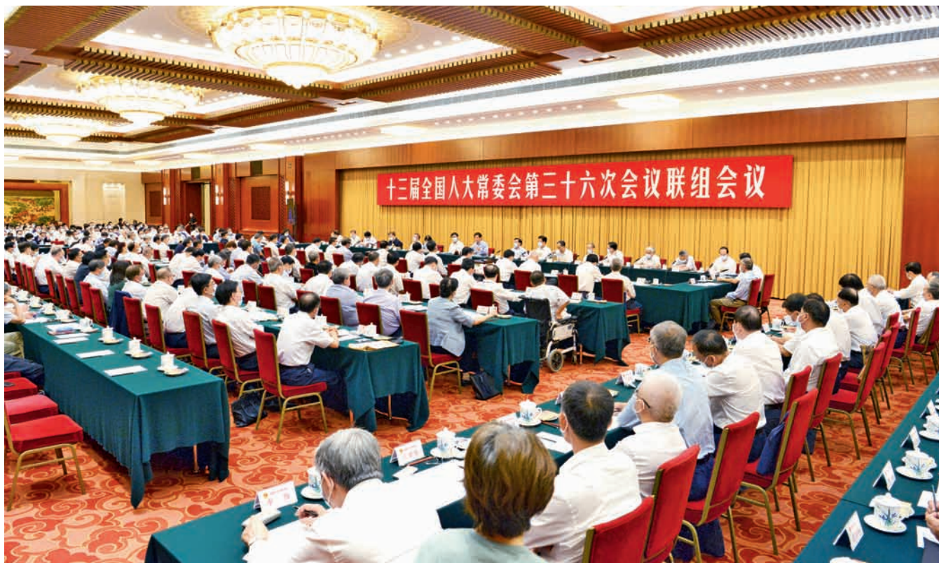
Li Zhanshu, chairman of the National People's Congress Standing Committee, speaks at a joint inquiry into a report on the enforcement of the Environmental Protection Law at the Great Hall of the People in Beijing on September 1.

More importantly, the positive momentum should be consolidated, he said, adding that the State Council and relevant departments will continue to fulfill their duties, promote green, low-carbon and circular development, and ramp up the efficiency of their regulatory work and law enforcement. (Xinhua) ■