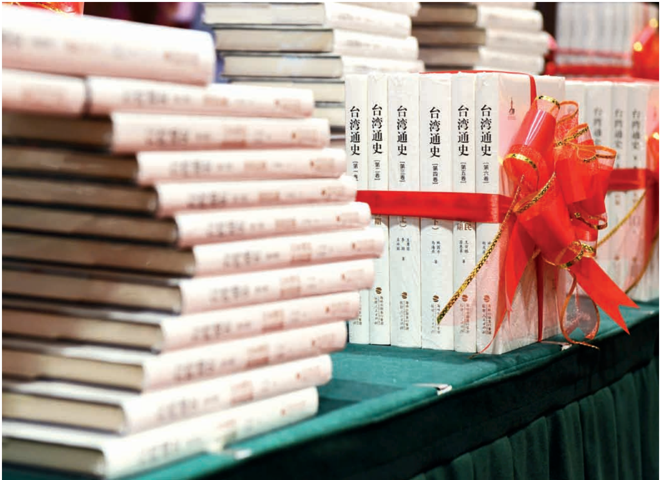
A six-volume book on Taiwan's history, jointly compiled by scholars on both sides of the Taiwan Straits, is shown after being released by the Fujian People's Publishing House in Beijing on July 17, 2021.

muniqué) are the real guardrails for peaceful coexistence between China and the United States.