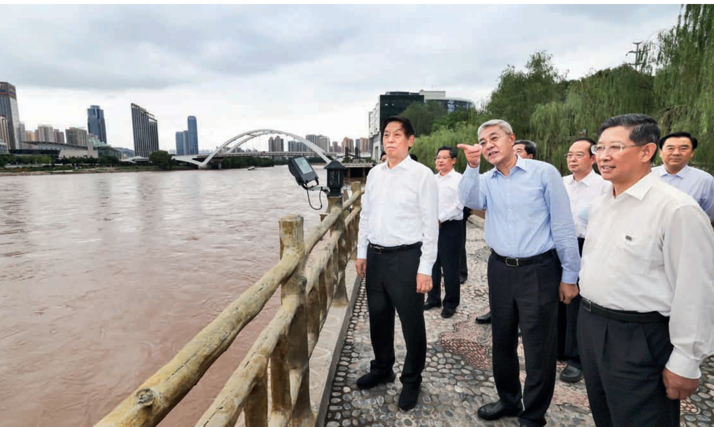
Li Zhanshu, member of the Standing Committee of the Political Bureau of the Communist Party of China Central Committee and chairman of the National People's Congress Standing Committee, visits Lanzhou during an inspection tour of northwest China's Gansu Province to learn about the province's ecological environment improvements, wetland protection work, water resource utilization, and cultural inheritance and protection of the Yellow River on August 27. Pang Xinglei