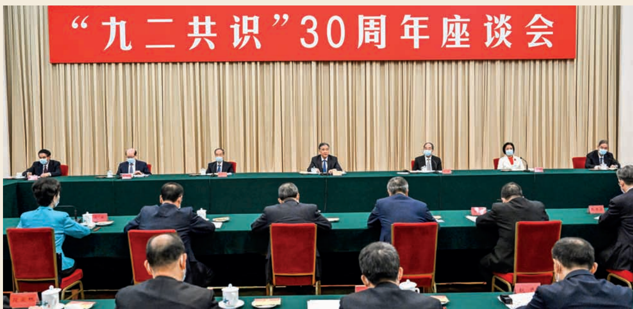
Wang Yang, member of the Standing Committee of the Political Bureau of the Communist Party of China Central Committee and chairman of the National Committee of the Chinese People’s Political Consultative Conference, addresses a meeting marking the 30th anniversary of the 1992 Consensus at the Great Hall of the People in Beijing on July 26.

A spokesperson for the Taiwan Work Office of the CPC Central Committee said the white paper demonstrated “our strong confidence toward complete national reunification, our resolute determination in fighting against separatist forces seeking ‘Taiwan independence’ and external interference, as well as our original aspiration in safeguarding the wellbeing of people on both sides of the Taiwan Straits.”