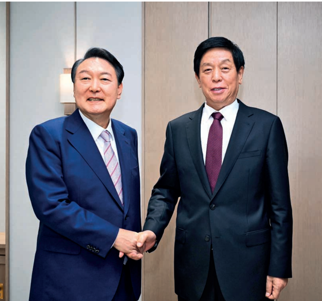
Li Zhanshu, chairman of National People's Congress Standing Committee, meets with South Korean President Yoon Suk-yeol in Seoul, Republic of Korea on September 16.