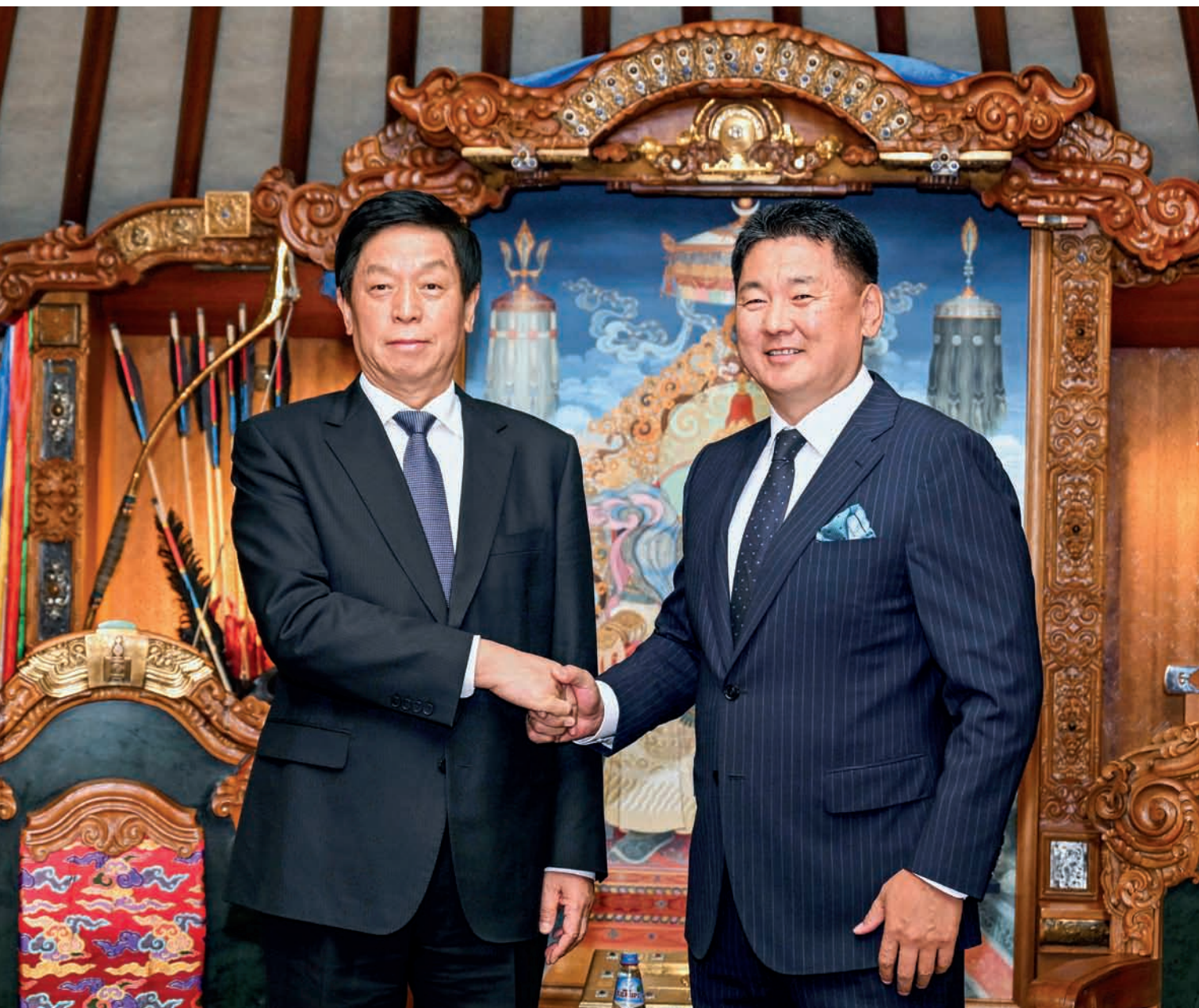
Li Zhanshu, chairman of National People's Congress Standing Committee, meets with Mongolian President Ukhnaa Khurelsukh in Ulan Bator, Mongolia on September 12.