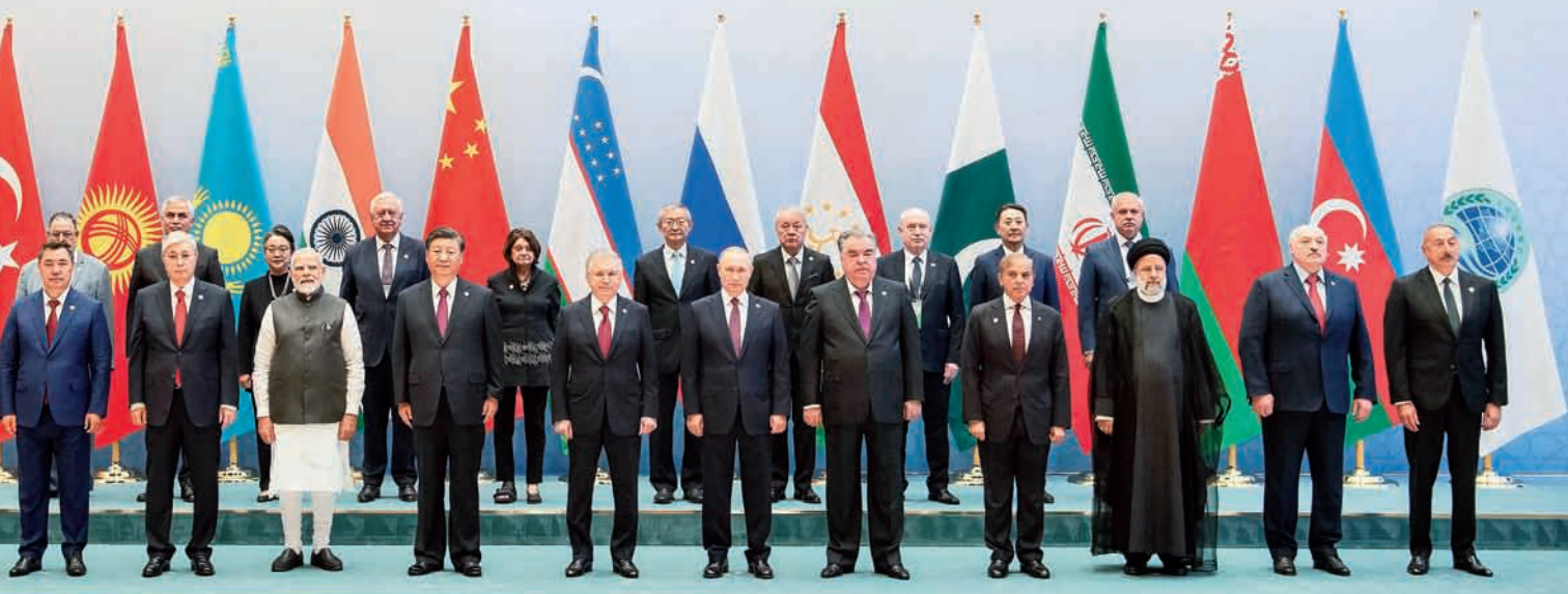
Chinese President Xi Jinping poses for a group photo with other leaders and guests ahead of the 22nd meeting of the Council of Heads of State of the Shanghai Cooperation Organization in Samarkand, Uzbekistan on September 16. Li Tao

MEETING OF THE COUNCIL OF HEADS OF THE SHANGHAI COOPERATION ORGANIZATION MEMBER STATES 15-16 September 2022, Samarkand