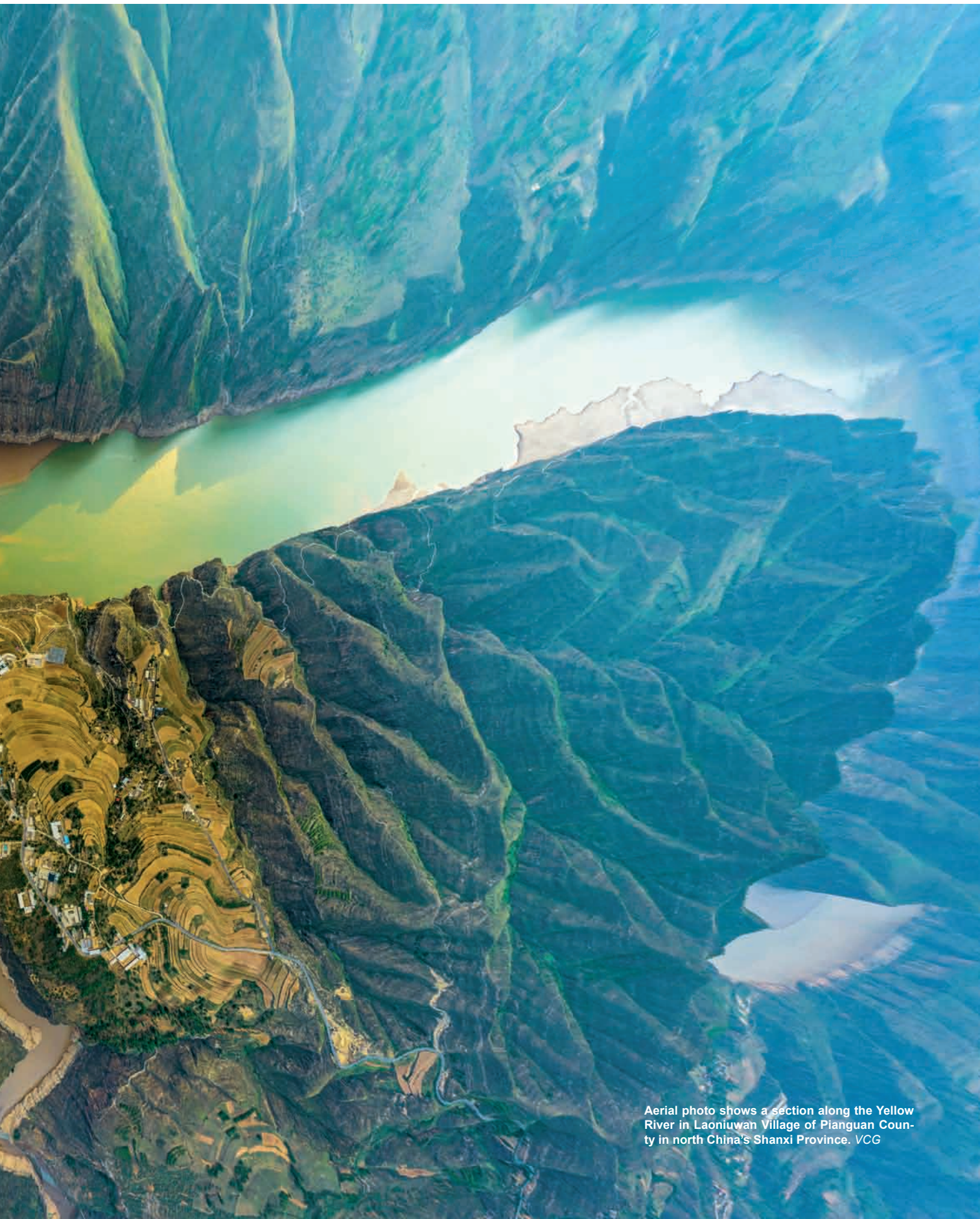
Aerial photo shows a section along the Yellow River in Laoniuwah Village of Pianguan County in north China's Shanxi Province.