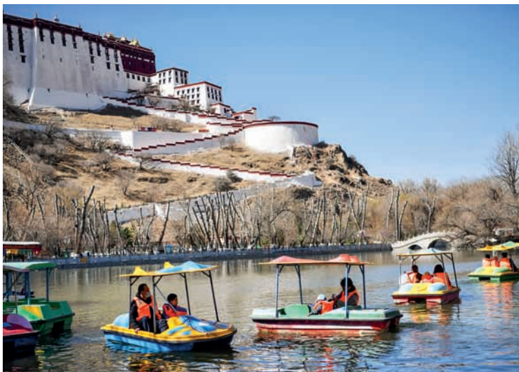
People row boats at Longwangtan Park in Lhasa of southwest China’s Tibet Autonomous Region on March 20. Chogo