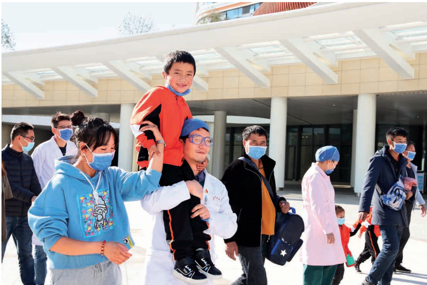
Nine children with congenital heart disease from Qamdo in southwest China's Tibet Autonomous Region are discharged from Fujian Children's Hospital in east China's Fujian Province after free surgery on December 1, 2021.

many other places in Tibet, but its geological features made it a hard nut to crack. Earthquakes, landslides and flows of debris are common in this area, often disrupting power and water supplies. It was the last county in China to have a paved road. It took some 40 years, from 1975 to 2013, to complete the county's first road, due to frequent natural disasters.