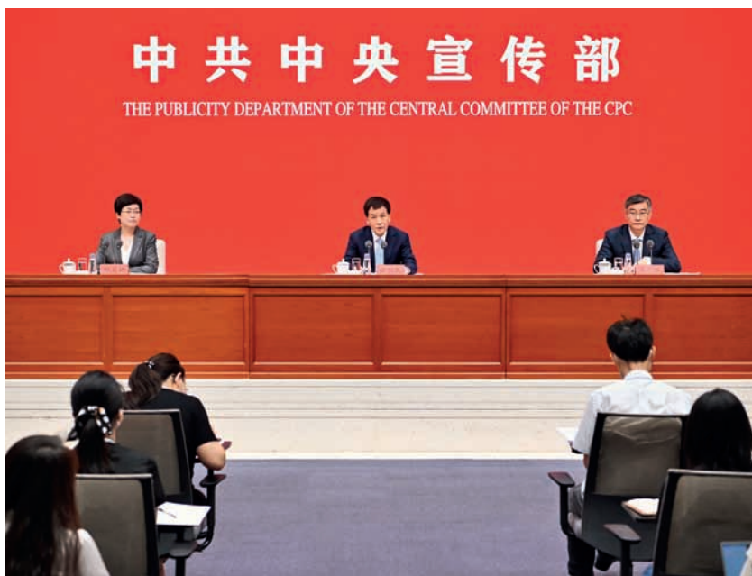
Deputy secretary general of the National People's Congress (NPC) Standing Committee Wang Tiemin (C) and director general of the Research Office of the General Office of the NPC Standing Committee Song Rui (R) attend a Central Committee of the Communist Party of China Publicity Department press conference on progress in upholding and improving the people's congress system in the new era in Beijing on June 29. Li Xin

"Those laws were made to meet people's increasing and urgent legal demands, and also to contribute to the country's