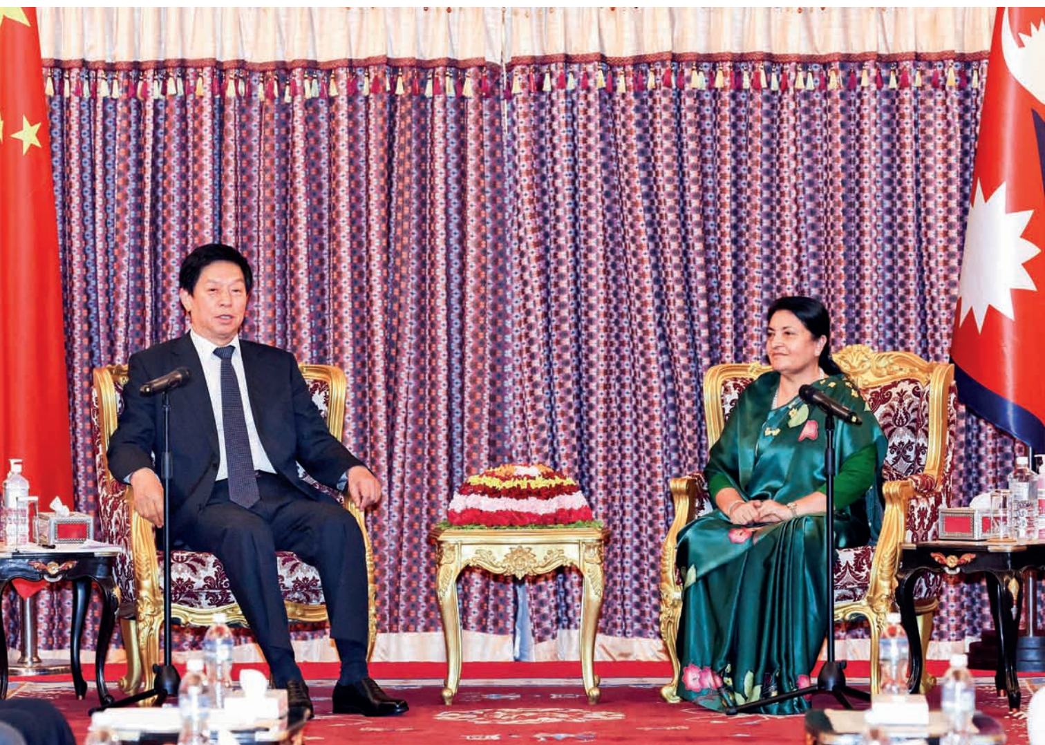
Li Zhanshu, chairman of National People's Congress Standing Committee, meets with Nepalese President Bidya Devi Bhandari in Kathmandu, Nepal on September 14.

greetings and best wishes from Xi and noted that China and Nepal are linked by mountains and rivers, while the two people have enjoyed friendly relations for generations.