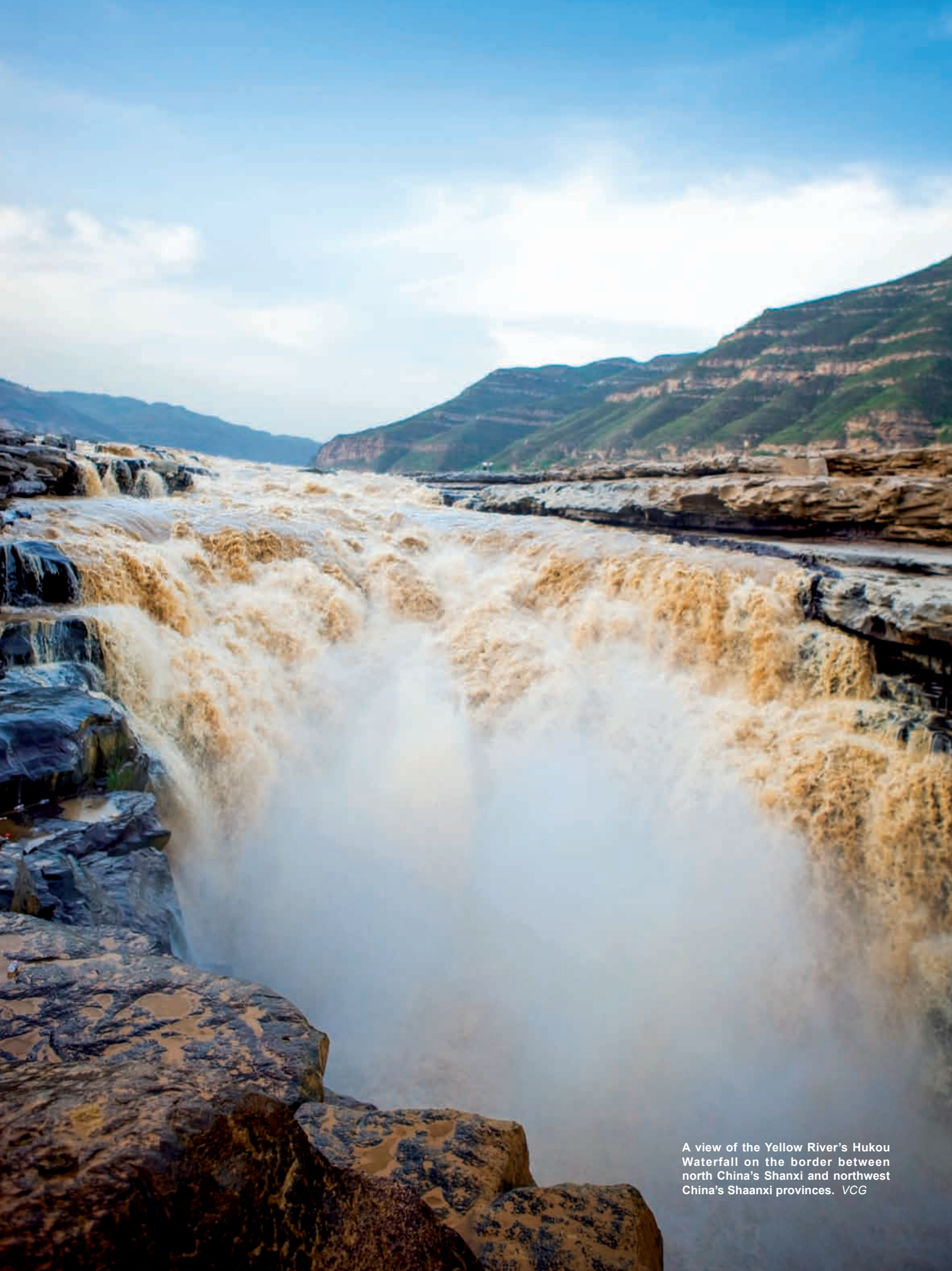
A view of the Yellow River's Hukou Waterfall on the border between north China's Shanxi and northwest China's Shaanxi provinces.