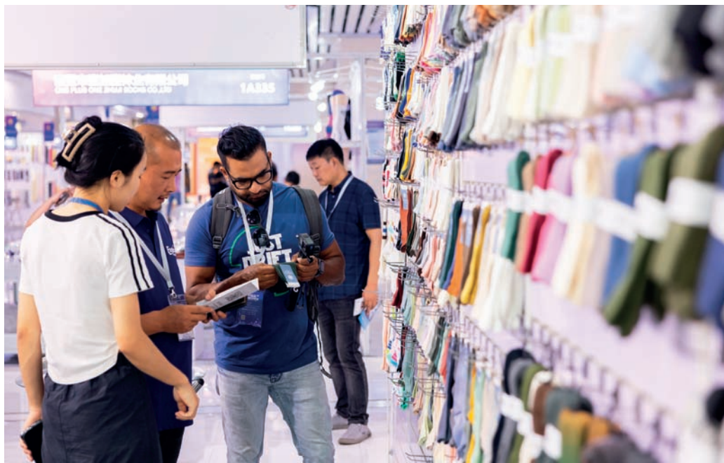
A foreign guest exchanges with an exhibitor at the 17th China Datang International Hosiery Industry Expo in Zhuji, east China's Zhejiang Province, on August 23. Guo Bin

China's IPR protection efforts are gaining it more credit.