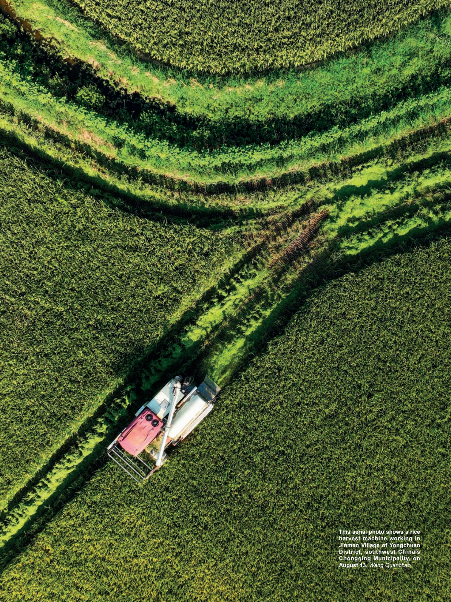
This aerial photo shows a rice harvest machine working in Jimmen Village of Yongchuan District, southwest China's Chongqing Municipality, on August 13. Wang Quanchao