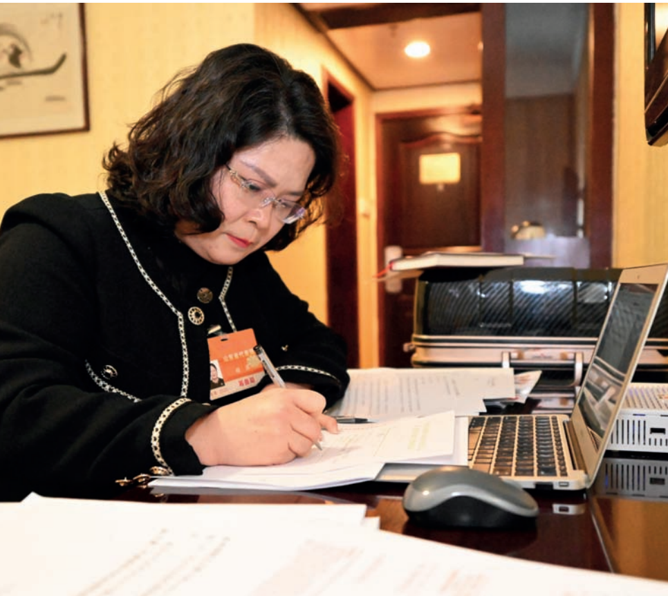
Cheng Ping, a deputy to the 14th National People's Congress (NPC), edits the suggestions she is preparing to submit during the annual session of the NPC in March 2023.