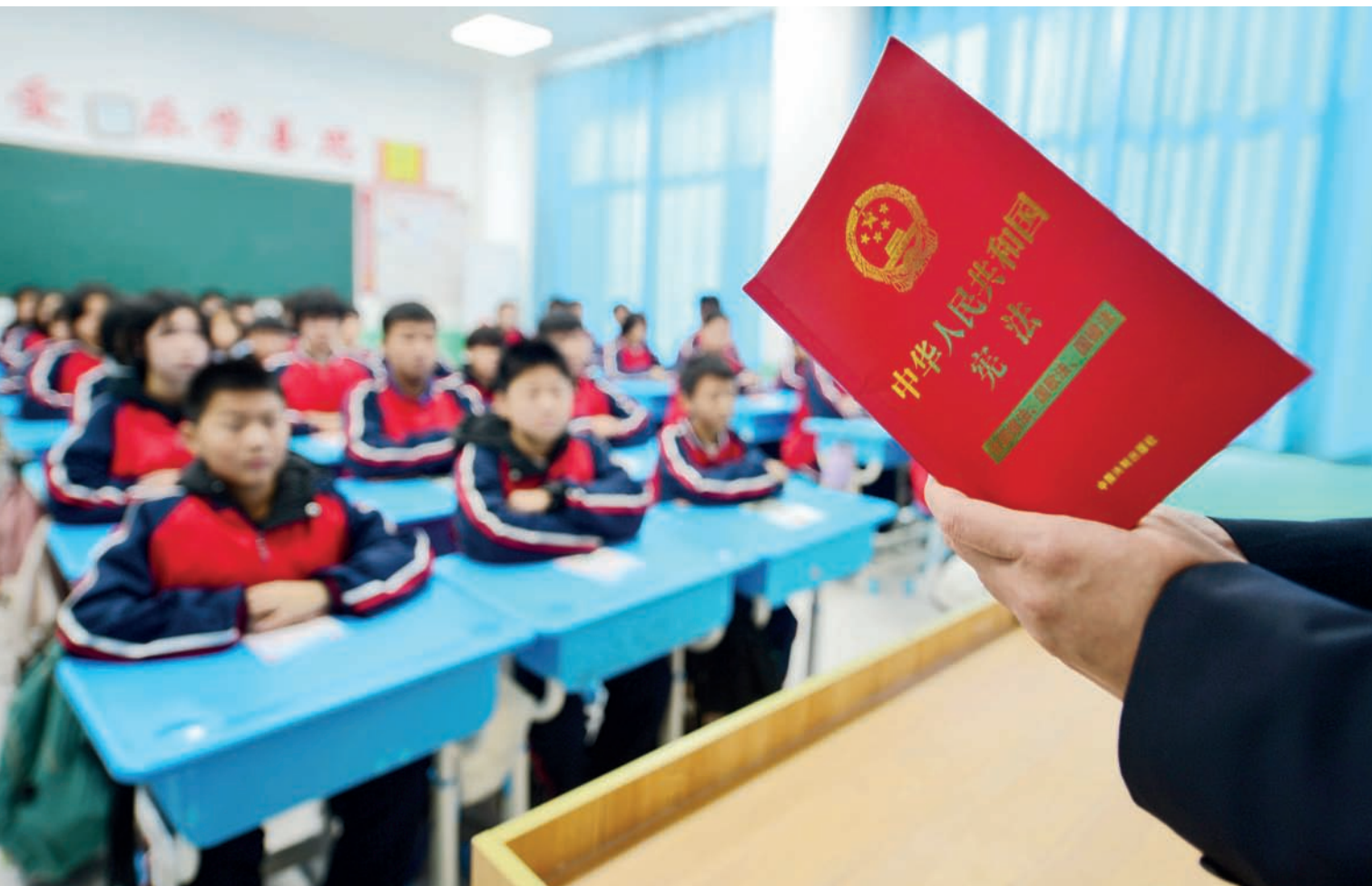
A staff member from the Cheng'an County People's Procuratorate explains the Constitution to students at the Seventh Middle School in Cheng'an County, Handan, north China's Hebei Province, on December 4.