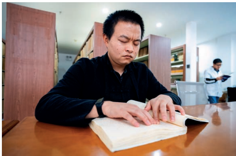
A visually impaired person reads Braille books at the reading room of the Yunnan Provincial Library in Kunming, southwest China’s Yunnan Province, on October 15.