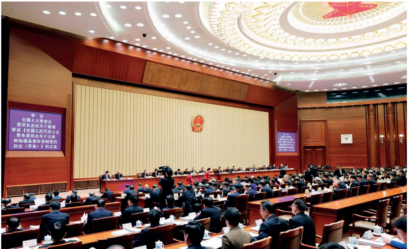
A draft decision on improving and strengthening the system of recording and review is submitted to the seventh session of the 14th National People's Congress Standing Committee for review in Beijing, capital of China, on December 25.