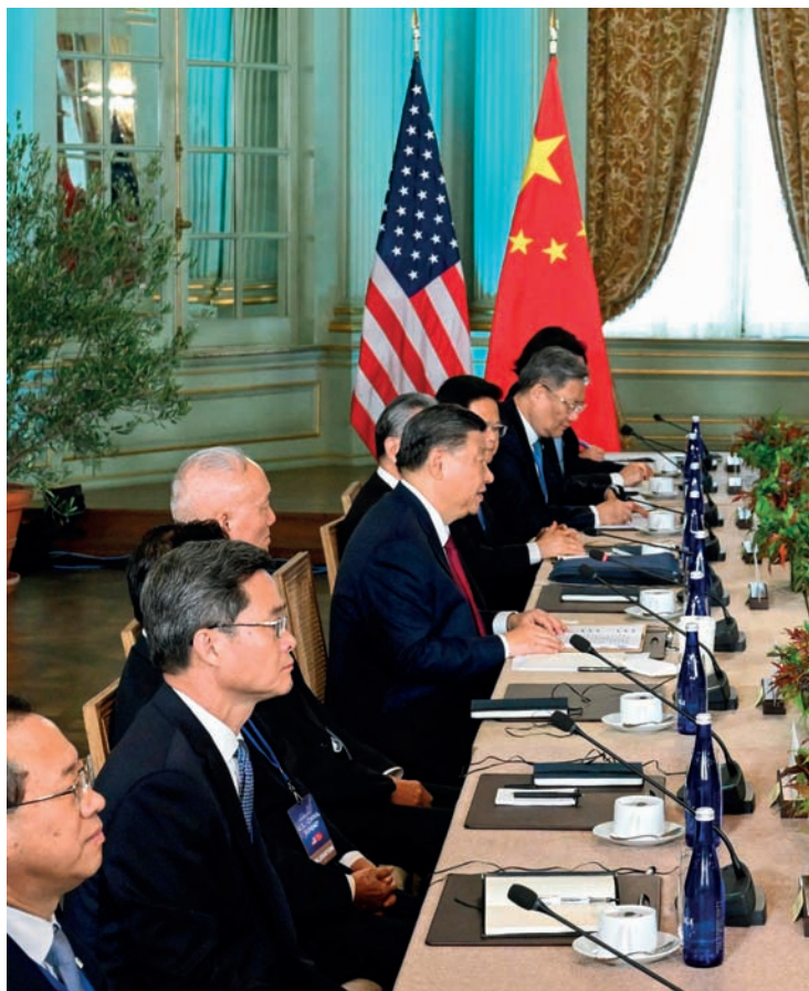
President Xi Jinping meets with U.S. President Joe Biden at Filoli Estate in the U.S. state of California, on November 15.

Xi also called on China and the United States to jointly shoulder responsibilities as major countries. The problems facing human society cannot be solved without cooperation between major countries, Xi said.