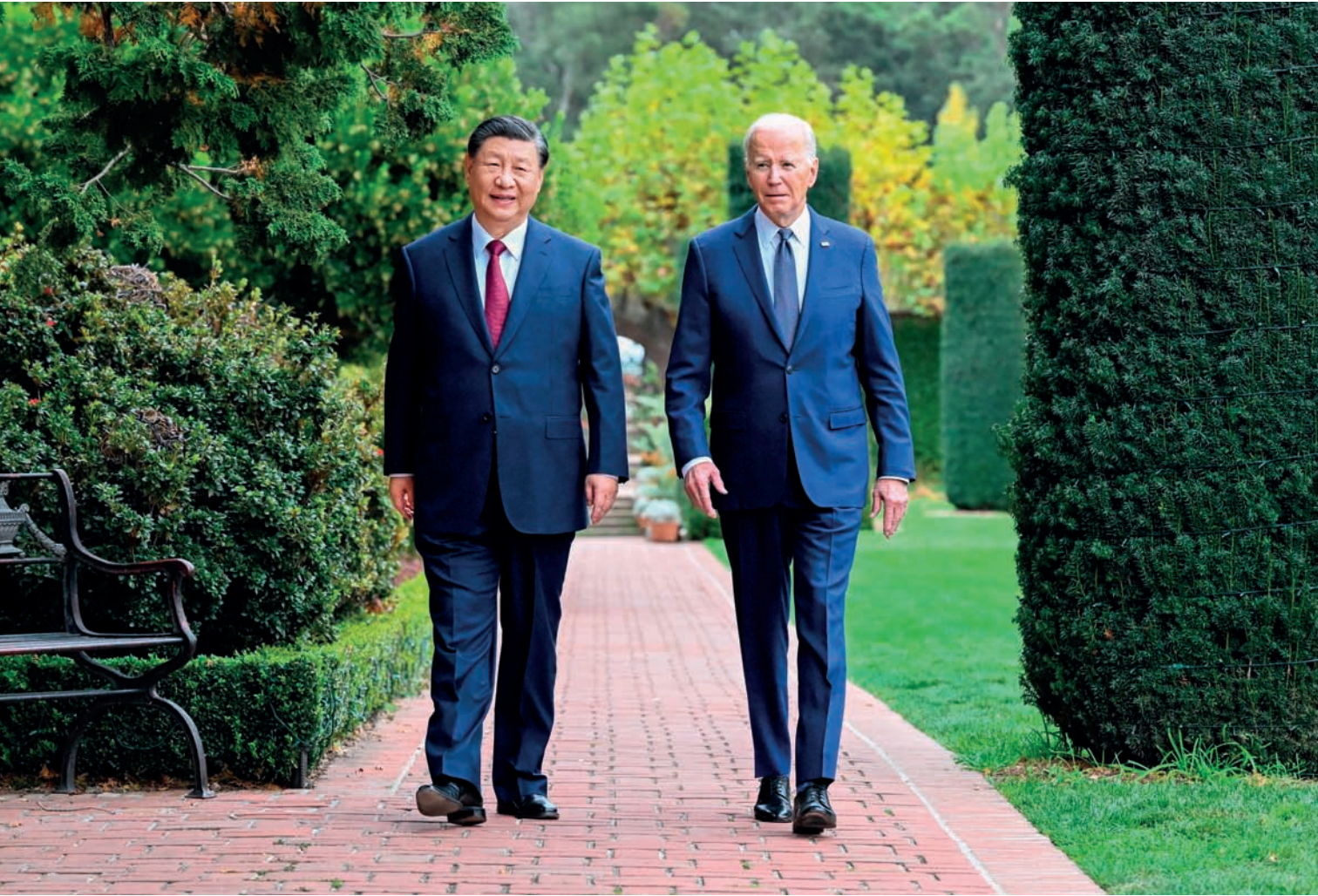
President Xi Jinping and U.S. President Joe Biden take a walk after their talks at Filoli Estate in the U.S. state of California, on November 15.