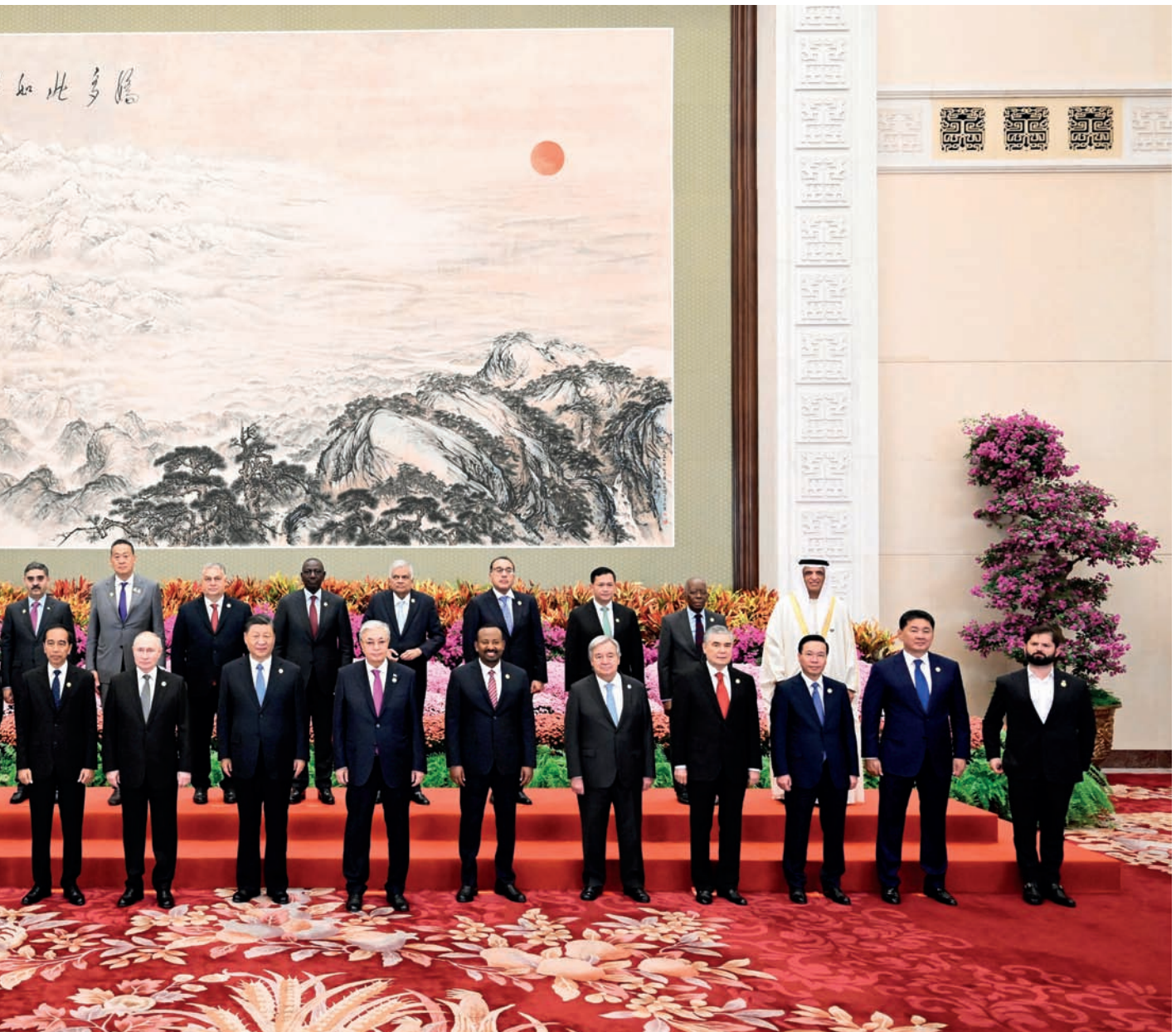
President Xi Jinping poses for a group photo with distinguished guests attending the Third Belt and Road Forum for International Cooperation at the Great Hall of the People in Beijing, capital of China, on October 18. Xi attended the opening ceremony of the Third Belt and Road Forum for International Cooperation and delivered a keynote speech on October 18. Shen Hong

tivity network. China will speed up high-quality development of the China-Europe Railway Express, participate in the trans-Caspian international transportation corridor, host the China-Europe Railway Express Cooperation Forum, and make joint efforts to build a new logistics corridor across the Eurasian continent linked by direct railway and road transportation. We will vigorously integrate ports, shipping and trading services under the “Maritime Silk Road,” and accelerate the building of the New International Land-Sea Trade Corridor and the Air Silk Road.