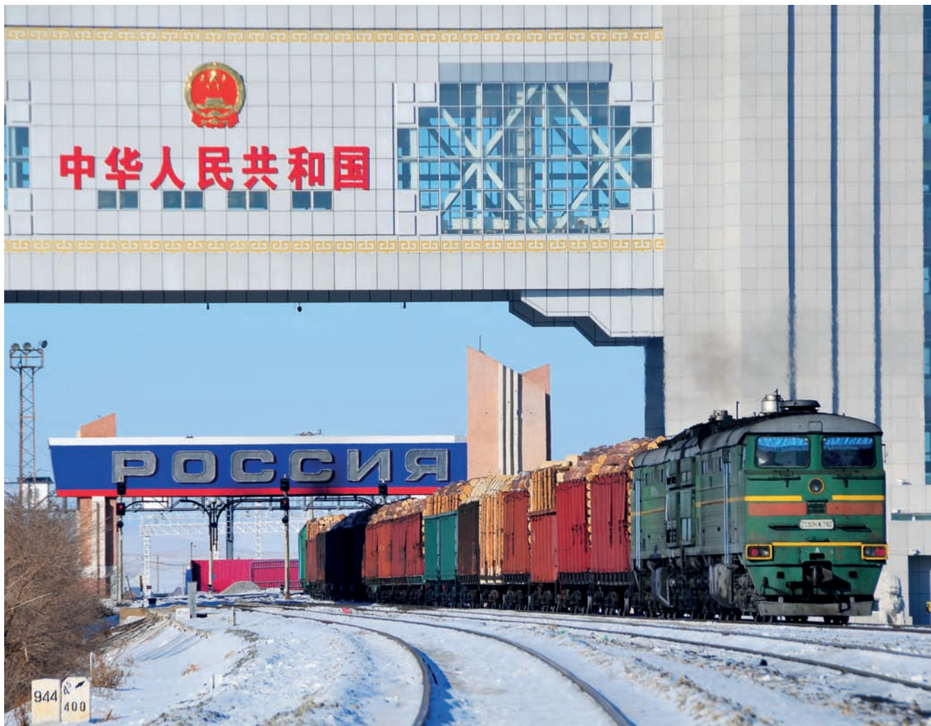
A freight train passes through the China-Russia border and enters Manzhouli in Hulunbuir, north China's Inner Mongolia Autonomous Region.

The Russian State Duma is willing to make joint efforts with the NPC to give play to the positive role of the Russia-China committee for parliamentary cooperation, provide a legal guarantee for the promotion of practical bilateral cooperation and contribute to the development of Russia-China relations, Volodin said. (Xinhua) ■