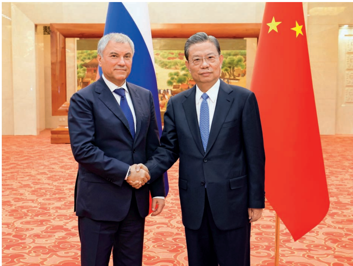
Zhao Leji, chairman of the National People's Congress Standing Committee, holds talks with chairman of the Russian State Duma Vyacheslav Volodin at the Great Hall of the People in Beijing, capital of China, on November 21.