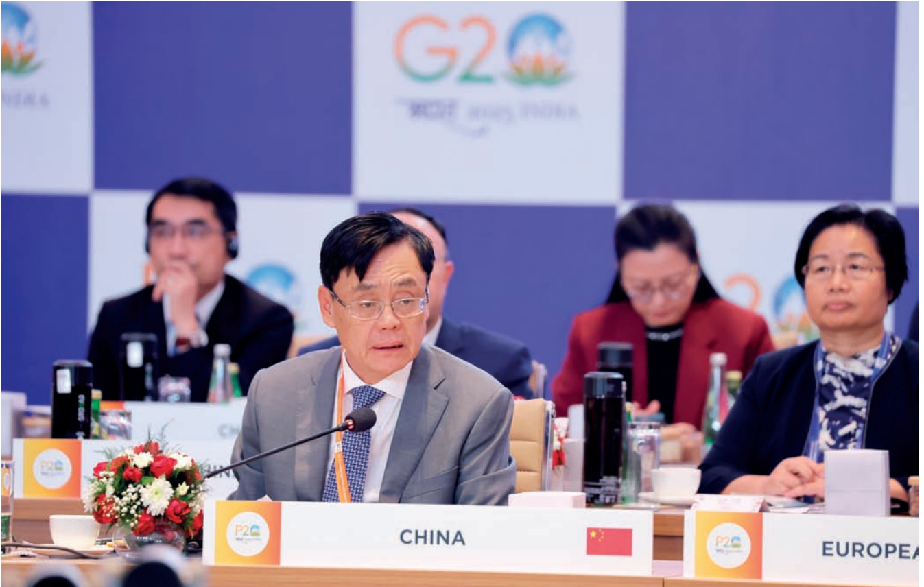
He Wei, vice chairman of the National People's Congress Standing Committee, delivers a keynote speech at the Ninth Group of 20 Parliamentary Speakers' Summit held in New Delhi, India, on October 13.