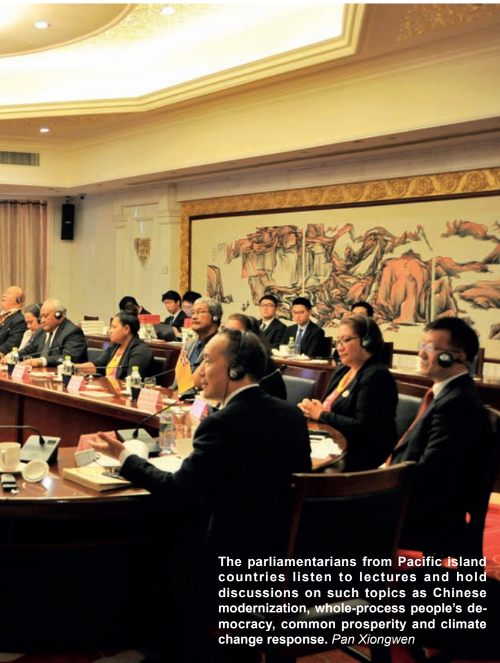
The parliamentarians from Pacific island countries listen to lectures and hold discussions on such topics as Chinese modernization, whole-process people's democracy, common prosperity and climate change response. Pan Xiongwen

During their trips in Beijing, Jiangxi and Fujian Province, parliamentarians witnessed the presence of green mountains and clear waters in abundance, demonstrating China’s determined efforts to reduce dependence on fossil fuels, promote the development and utilization of renewable energy sources, produce electric vehicles, and establish an extensive network