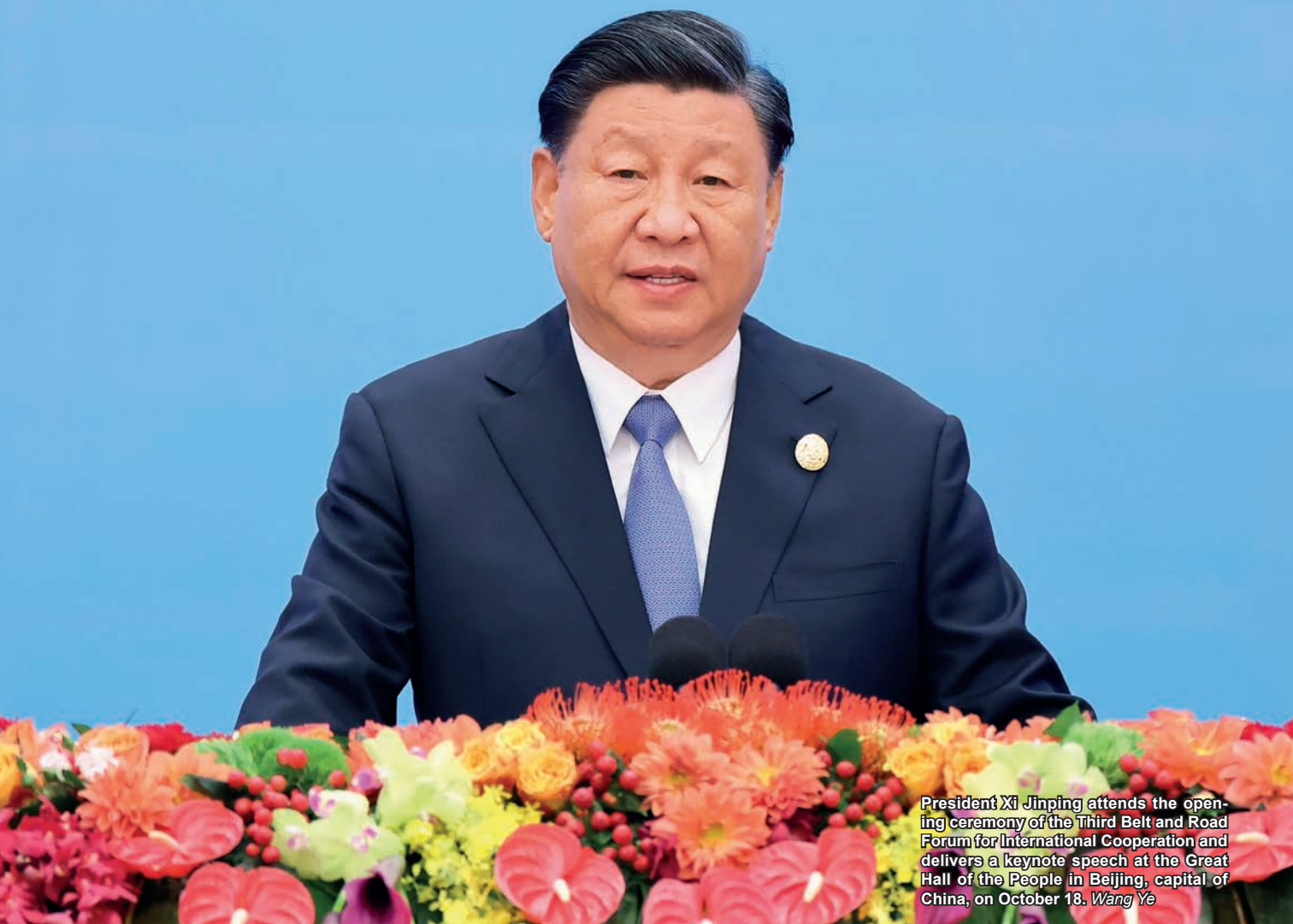
President Xi Jinping attends the opening ceremony of the Third Belt and Road Forum for International Cooperation and delivers a keynote speech at the Great Hall of the People in Beijing, capital of China, on October 18.