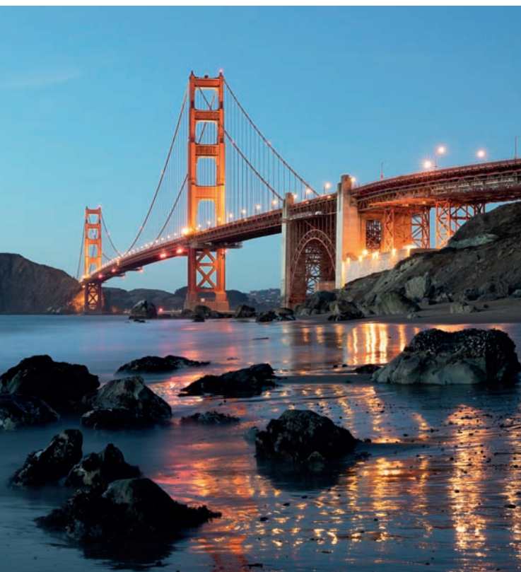
This photo taken on October 29 shows the Golden Gate Bridge in San Francisco, California, the United States. The 30th APEC Economic Leaders' Meeting was held in San Francisco on November 17. Li Jianguo