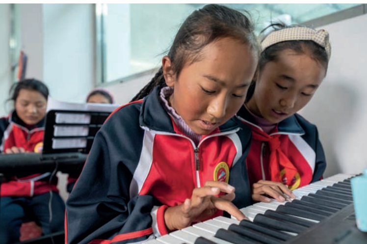
Pupils attend a piano class at a primary school of Zhaxizom Township in Tingri County of Xigaze, southwest China's Xizang Autonomous Region, on June 5.