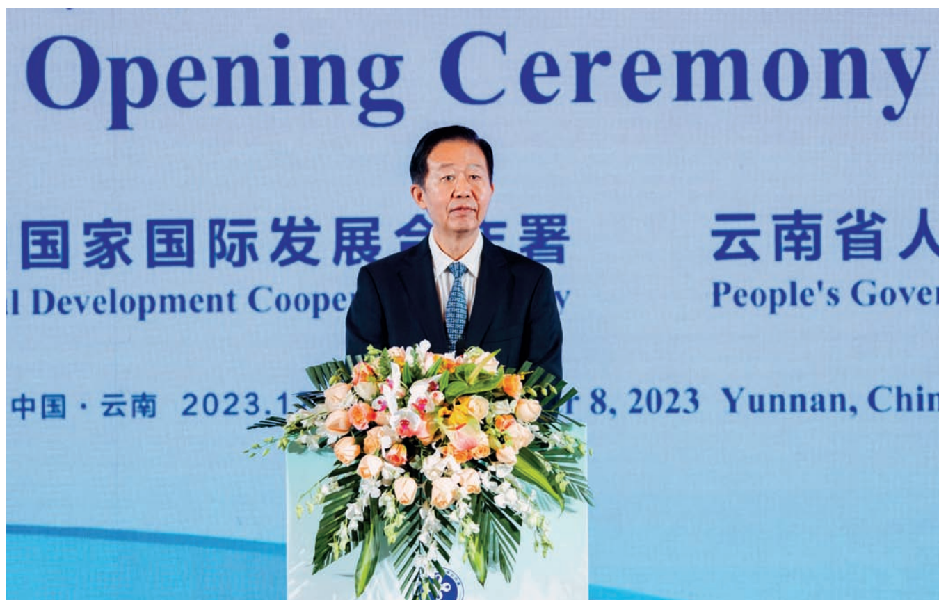
Xiao Jie, vice chairman of the National People's Congress Standing Committee, attends and addresses the opening ceremony of the Second China-Indian Ocean Region Forum on Development Cooperation in Kunming, capital city of southwest China's Yunnan Province, on December 8.

Themed "Boosting Sustainable Blue Economy to Build Together a Maritime Community with a Shared Future," the forum was co-hosted by the China International Development Cooperation Agency and the Yunnan provincial government. (NPC) ■