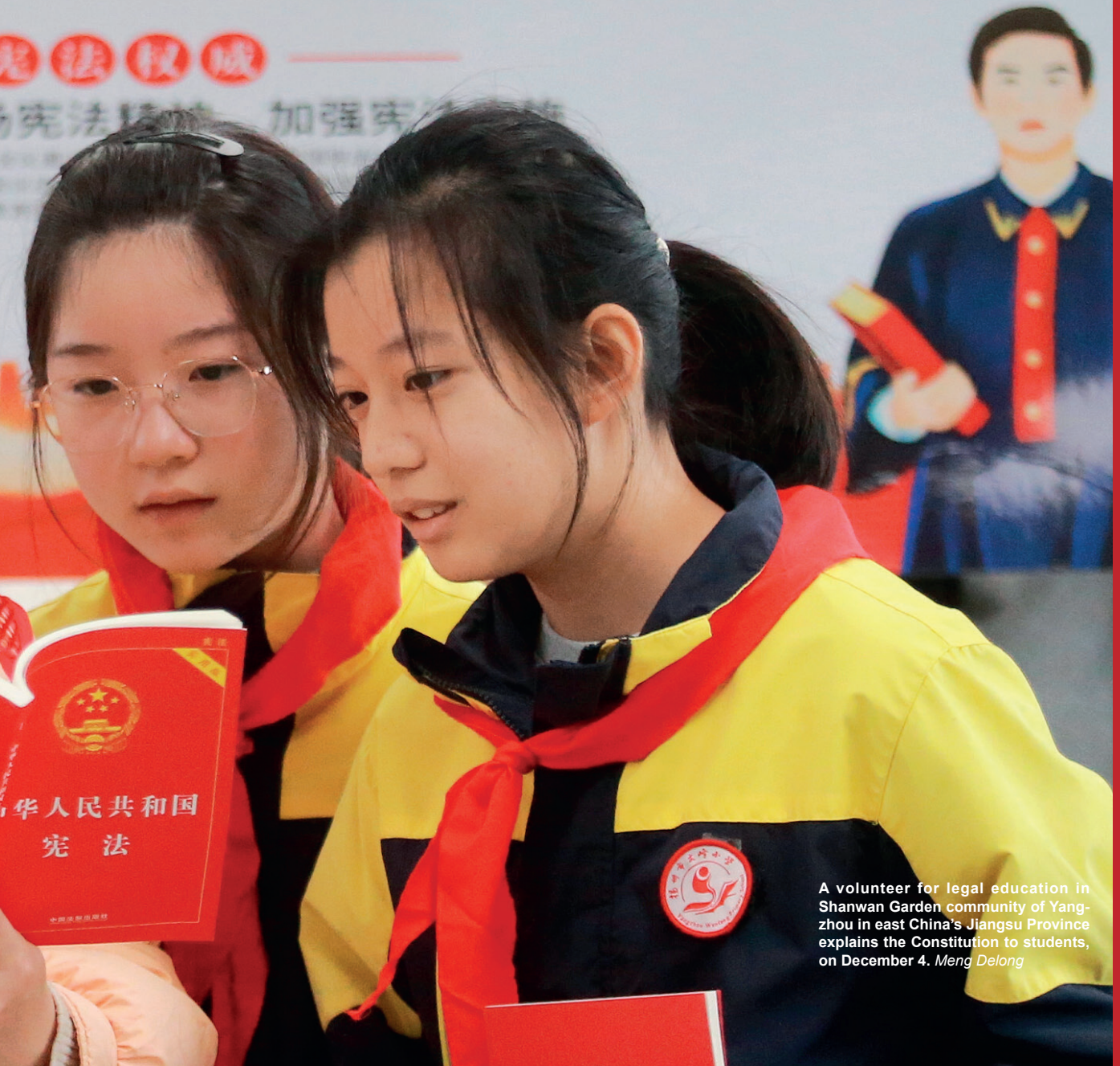
A volunteer for legal education in Shanwan Garden community of Yangzhou in east China's Jiangsu Province explains the Constitution to students, on December 4.