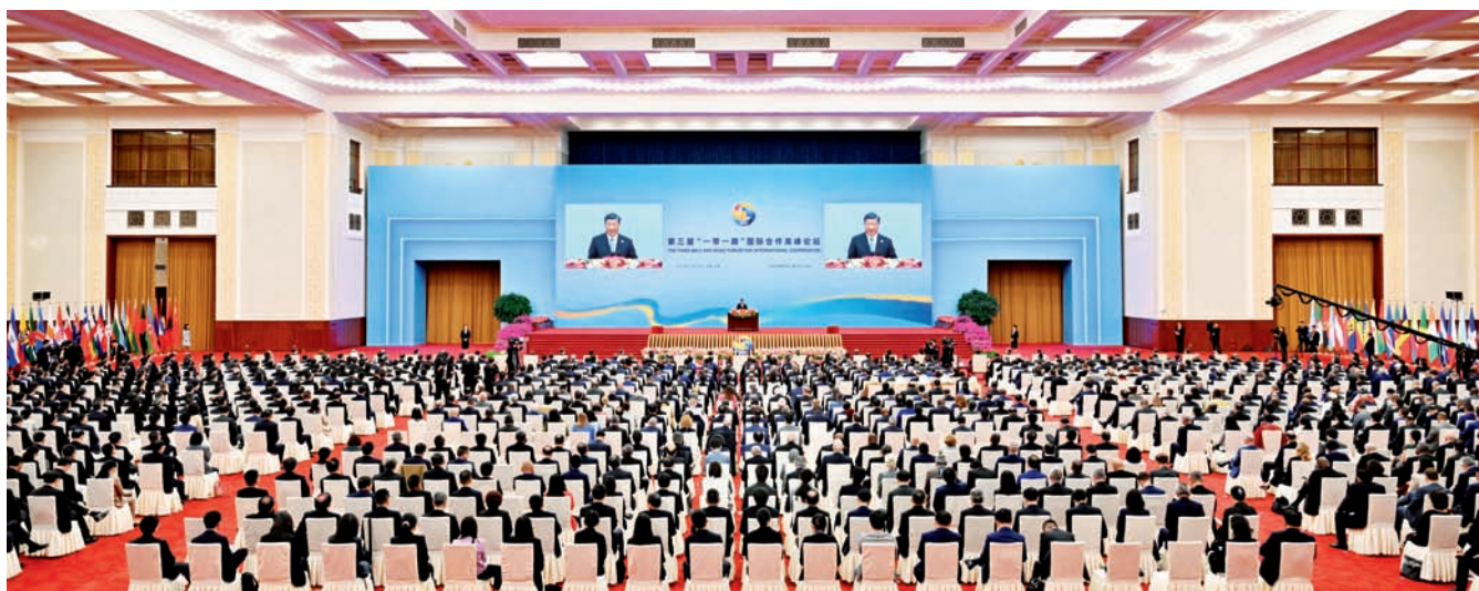
President Xi Jinping attends the opening ceremony of the Third Belt and Road Forum for International Cooperation and delivers a keynote speech at the Great Hall of the People in Beijing, capital of China, on October 18.