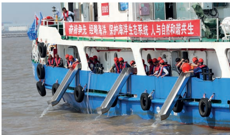
Staff members release fry to the sea at an area of a marine ecological protection and restoration project in Lingang, east China's Shanghai Municipality, on June 8. Fang Zhe