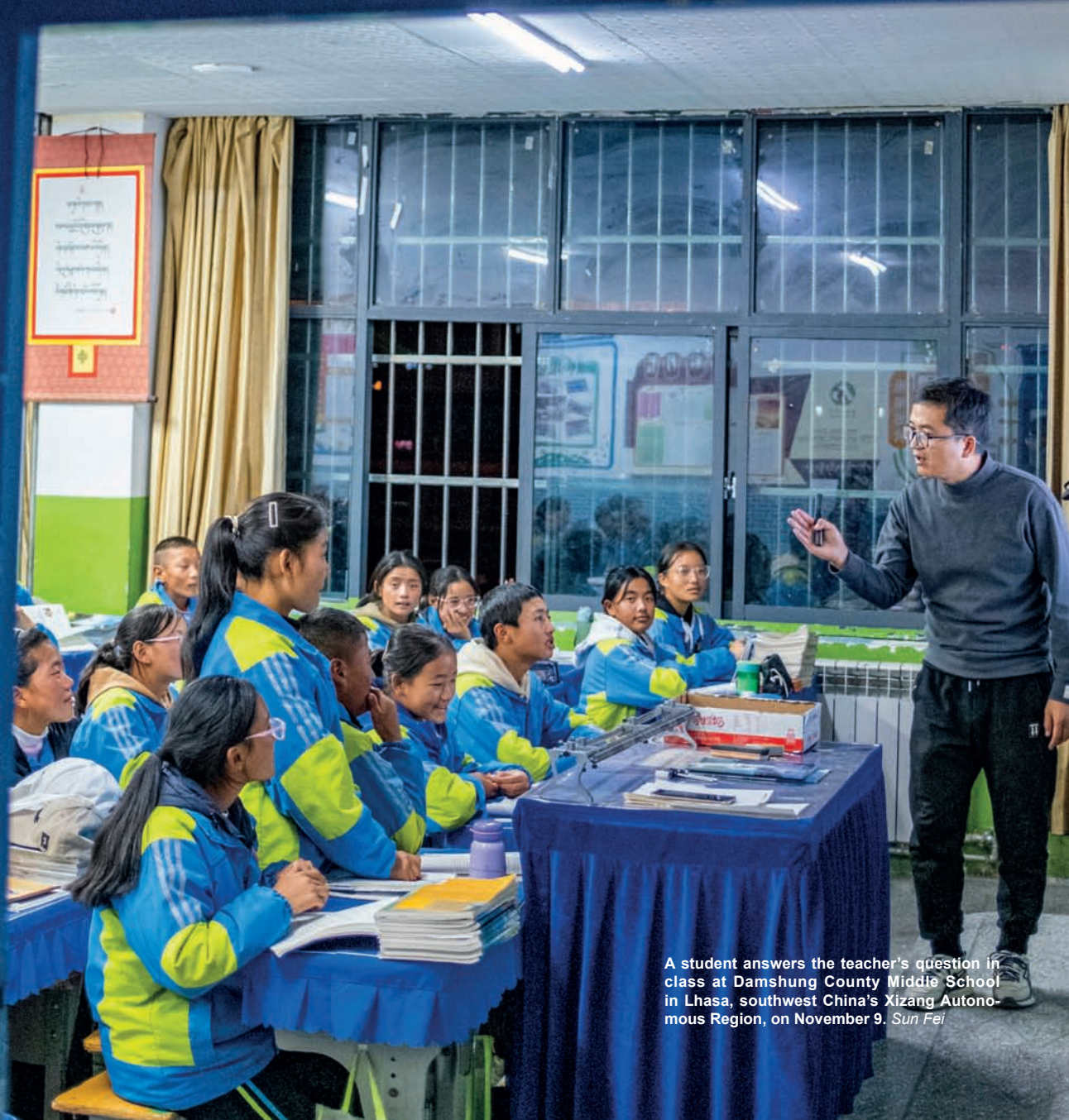
A student answers the teacher's question in class at Damshung County Middle School in Lhasa, southwest China's Xizang Autonomous Region, on November 9.