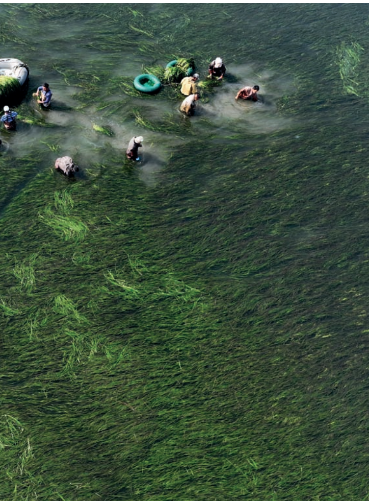
This aerial photo shows staff members working at the eelgrass seedling collecting area of a marine ecological protection and restoration project in Cao-feidian of Tangshan, north China's Hebei Province, on June 25. Yang Shiyao