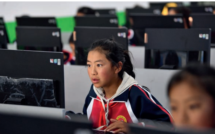
Pupils attend a computer class at a primary school of Zhaxizom Township in Tingri County of Xigaze, southwest China's Xizang Autonomous Region, on June 5.