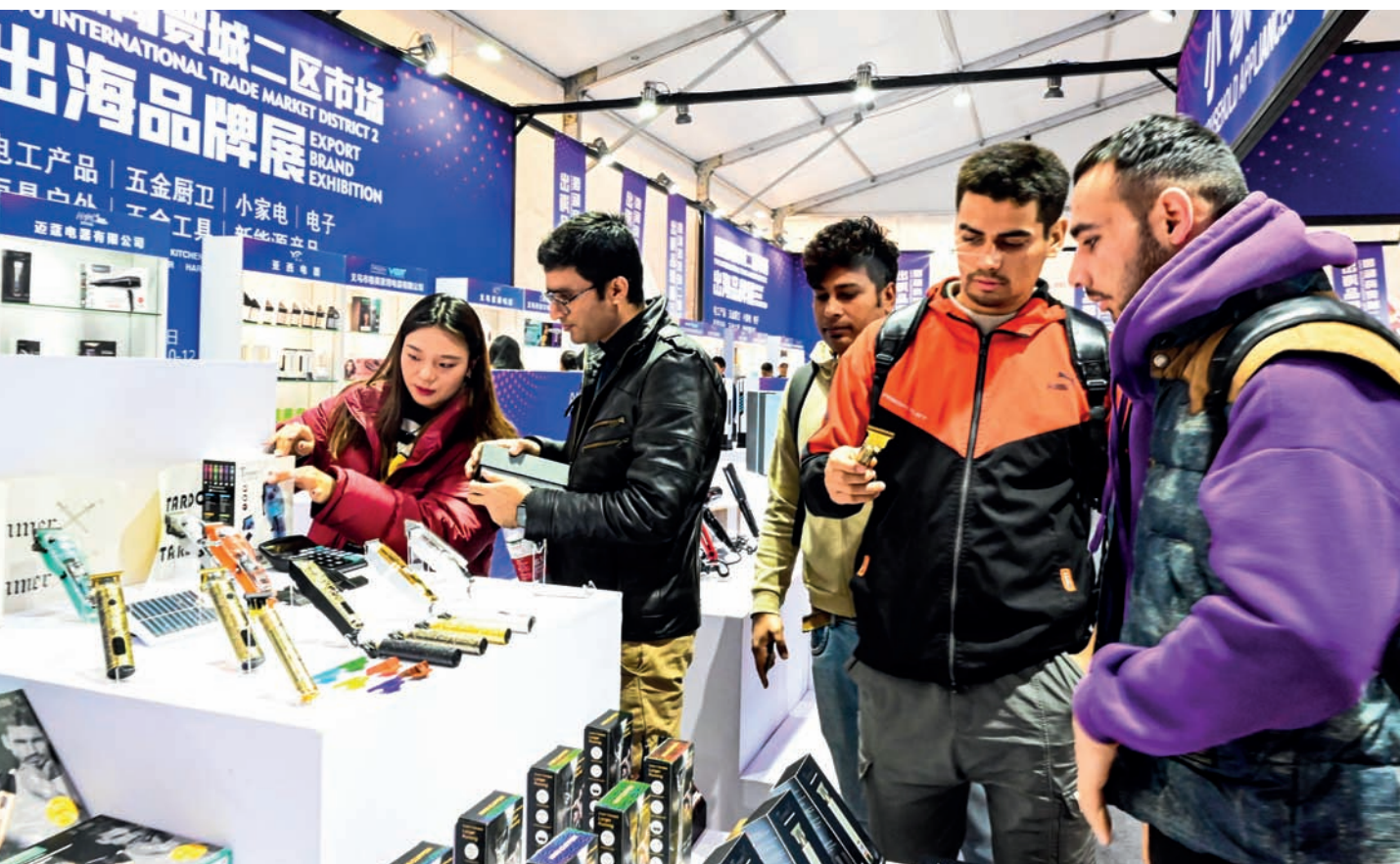
Foreign consumers purchase home appliances at Yiwu International Trade City in Yiwu, east China's Zhejiang Province, on December 10.