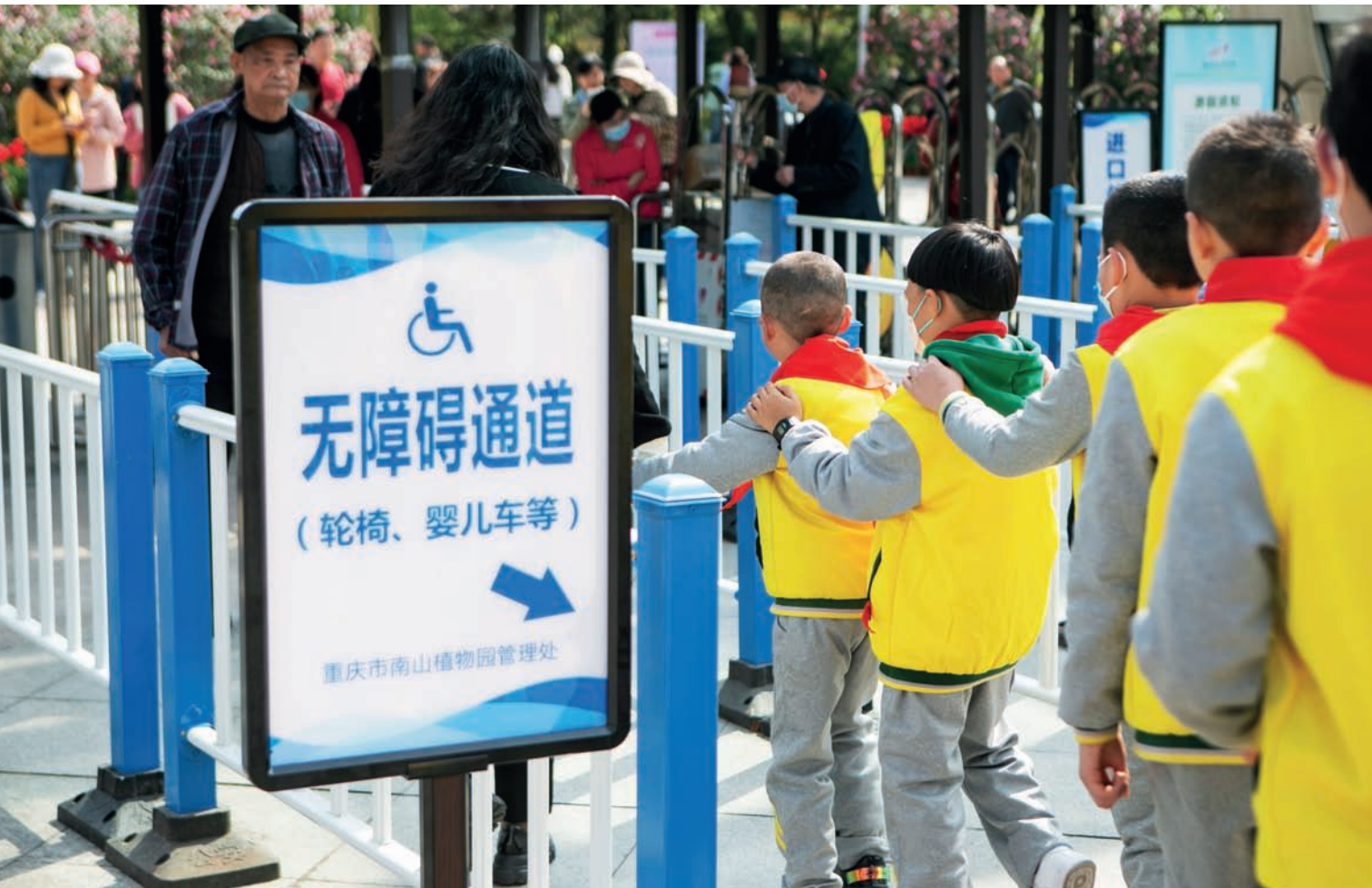
Visually impaired students from Chongqing Special Education Center enter the Nanshan Botanical Garden in southwest China's Chongqing Municipality, on March 14. Chu Jiayin