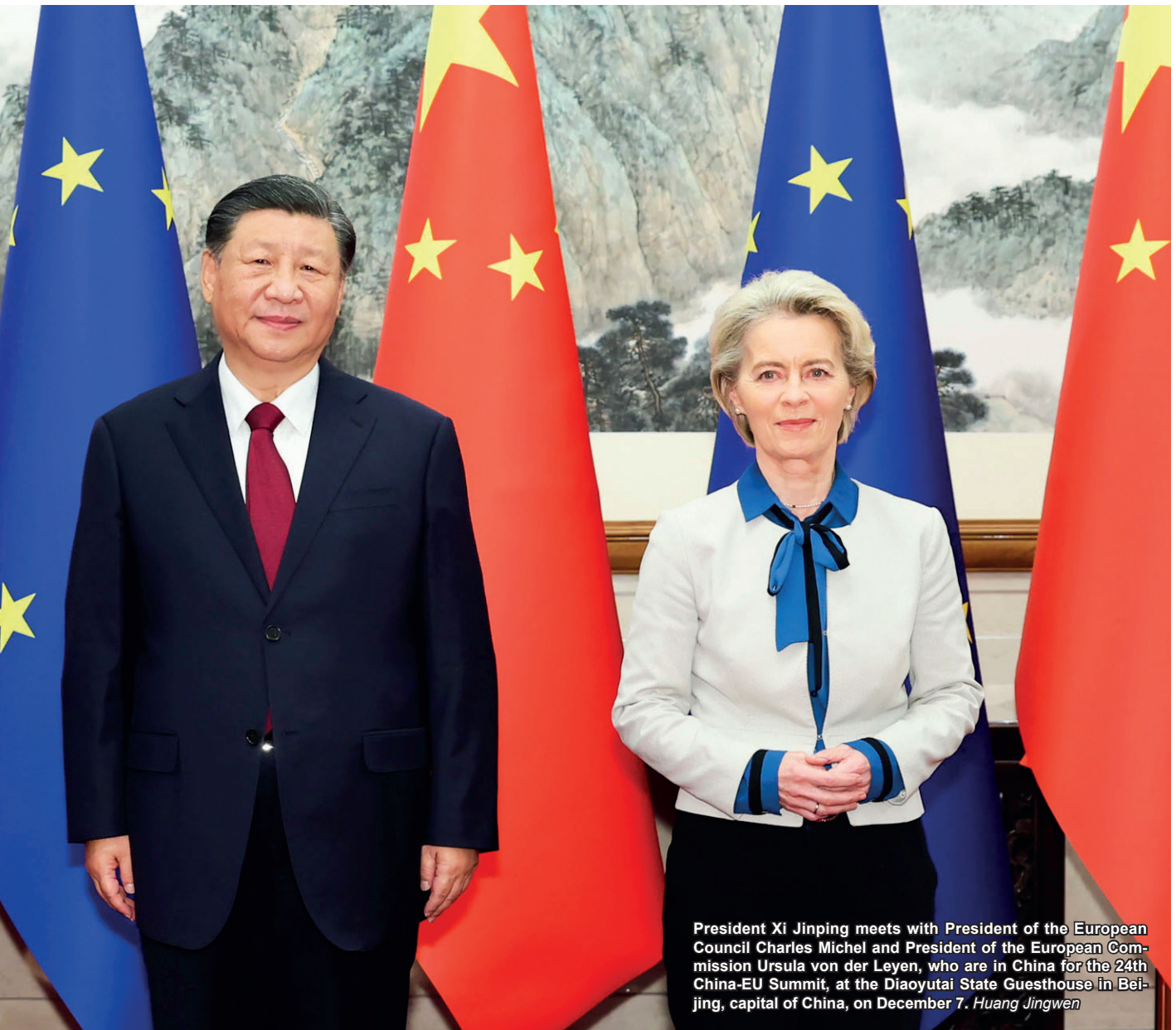
President Xi Jinping meets with President of the European Council Charles Michel and President of the European Commission Ursula von der Leyen, who are in China for the 24th China-EU Summit, at the Diaoyutai State Guesthouse in Beijing, capital of China, on December 7.

ital fields have produced rich outcomes.