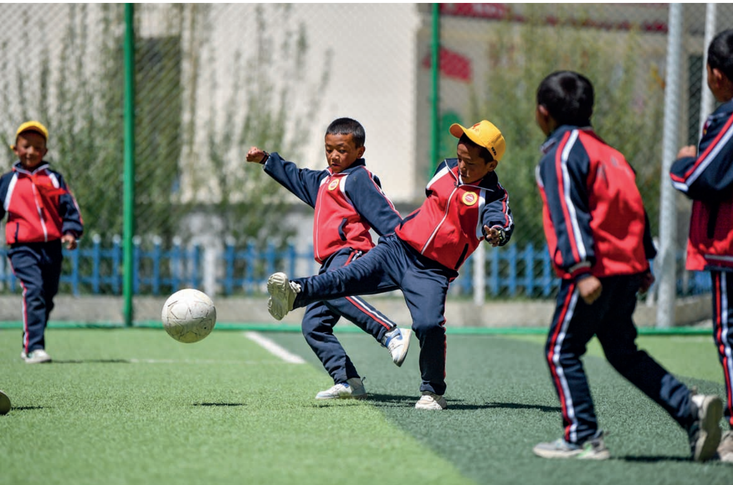
Pupils play football at a primary school of Zhaxizom Township in Tingri County of Xigaze, southwest China's Xizang Autonomous Region, on June 5.