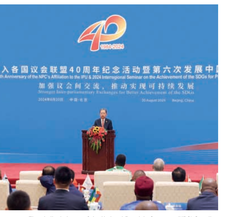
Zhao Leji, chairman of the National People's Congress (NPC) Standing Committee, addresses a commemoration of the 40th anniversary of the NPC's affiliation with the Inter-Parliamentary Union (IPU) and the opening ceremony of the 2024 interregional seminar on the achievement of the Sustainable Development Goals for parliaments of developing countries at the Great Hall of the People in Beijing, capital of China, Aug. 20, 2024. Liu Weibing

hina stands ready to work with the Inter-Parliamentary Union (IPU) and legislative bodies of other countries to expand forms of exchange, enrich the content of cooperation and constantly work toward fruitful results, top Chinese legislator Zhao Leji said on August 20.