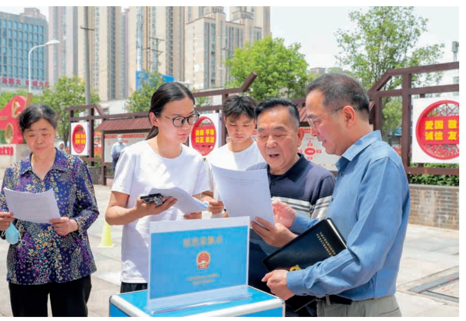
Deputies to the National People's Congress collect public suggestions on legislation at a legislative outreach office at Jiangxinyuan community in Hanyang District in Wuhan, Central China's Hubei Province. Chen Yu

Stories of democracy: how public voices become important references for legislation in China