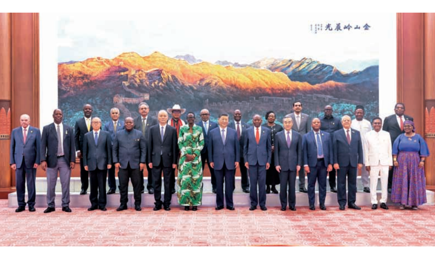
Chinese President Xi Jinping meets with foreign parliamentary leaders attending the commemoration of the 40th anniversary of China's National People's Congress' affiliation to the Inter-Parliamentary Union, as well as the 2024 interregional seminar on the achievement of the Sustainable Development Goals for parliaments of developing countries, at the Great Hall of the People in Beijing, capital of China, Aug. 20, 2024. Liu Weibing