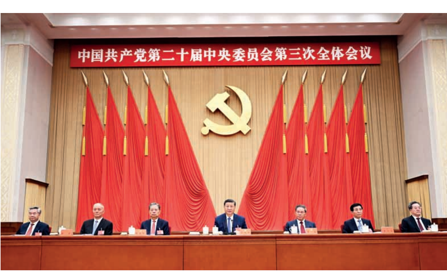
Xi Jinping, Li Qiang, Zhao Leji, Wang Huning, Cai Qi, Ding Xuexiang and Li Xi attend the third plenary session of the 20th Communist Party of China (CPC) Central Committee in Beijing, capital of China.