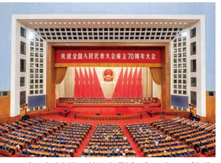
A meeting is held to celebrate the 70th founding anniversary of the National People's Congress at the Great Hall of the People in Beijing, capital of China, Sept. 14, 2024. Zhai Jianlan

It is important that people's congresses play a leading role in legislative work, Xi said. He urges efforts to improve the legislative framework featuring guidance from Party committees, the leading role played by people's congresses, support from the government, and participation by all parties. Efforts should be made to step up legislation in key, emerging, and foreign-related fields, improve the quality of legislation, and continuously improve the socialist legal system with Chinese characteristics. He also urged efforts to accelerate the improvement of a legal system featuring equal rights, equal opportunities and fair rules for all to ensure that citizens fully enjoy their rights.