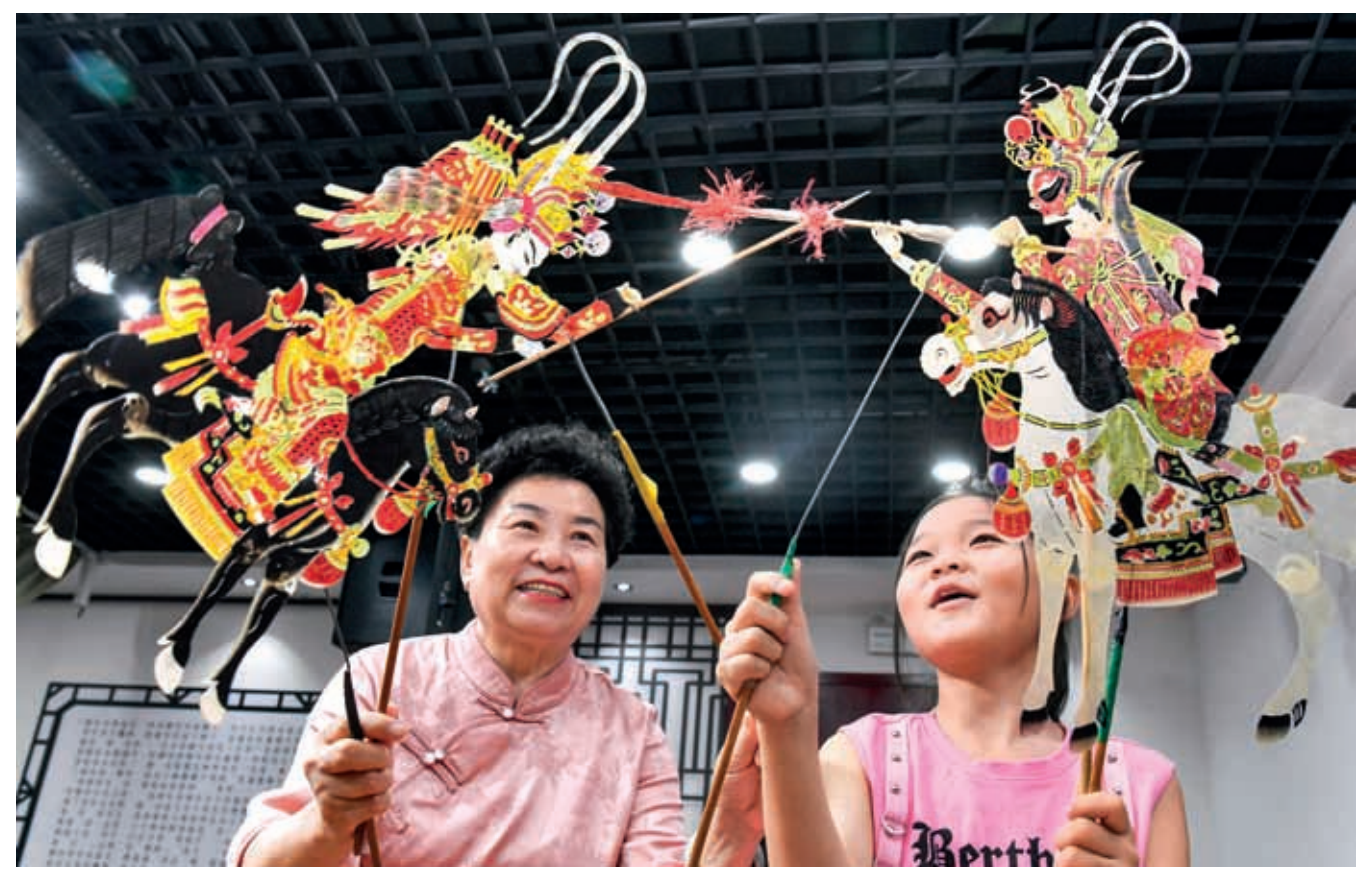
An artist guides a pupil to learn shadow puppetry at the First Experimental Primary School in Hejian City, North China's Hebei Province, on July 26, 2024.