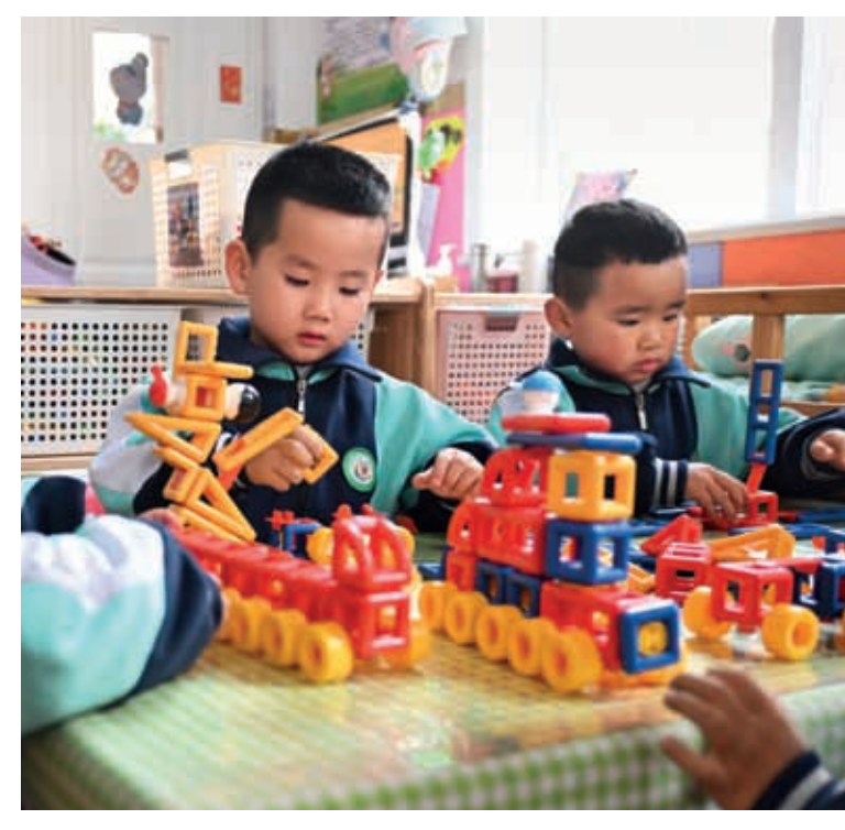
Children at a kindergarten in Huangyuan county of Xining, Northwest China's Qinghai Province, have a handicraft class, on Nov 29, 2023.