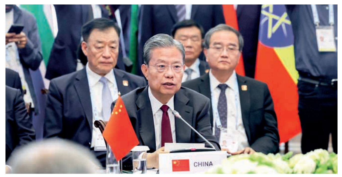
Zhao Leji, chairman of China's National People's Congress Standing Committee, delivers a speech while attending the plenary session of the 10th BRICS Parliamentary Forum in St. Petersburg, Russia, July 11, 2024. Liu Weibing