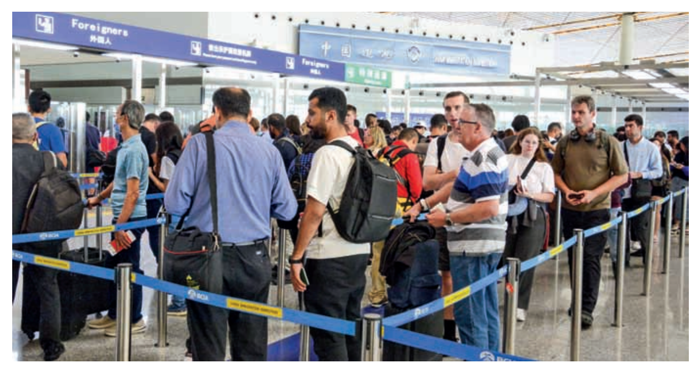
Foreign passengers enter the border check section of Beijing Capital International Airport, on July 10, 2024. Li Xin