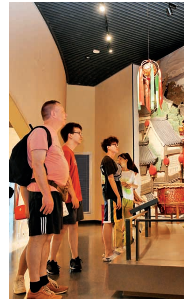
Tourists visit the exhibition hall for the intangible cultural heritage of China's Grand Canal, on Aug 2, 2024.

The team found that some government entities still lacked adequate understanding and commitment to the legal obligations around intangible cultural heritage preservation. It stressed the need for government departments to strengthen its capacity to enforce the laws and regulations, and to ensure that the proper systems and resources are in place to